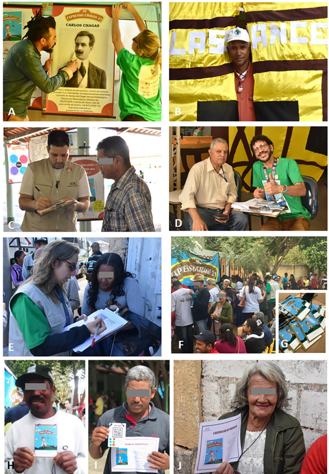
Fig 2. Images of the Station entry and exit points: (A) Setting up the exhibition and presenting Carlos Chagas, the scientist who discovered the disease in 1909; (B) Scenography of the exhibition entry named station “Lassance”, alluding to the village where the discovery took place; (C,D,E) Filling forms for each visitant; (F) crowded waiting line to attend the activities in a local school at Espinosa city, Minas Gerais; (G) a set of badges (identification cards) for the visiting public. Note the green T-shirt that identified the field team of the project (A,D,E) and the field jacket (C) that is used in field institutional missions (C, D); (H,J) proud visitants showing their front (H) and back (I) views of their badge and certificate (J) smiling to express joy and happiness.

https://doi.org/10.1371/journal.pntd.0009534.g002