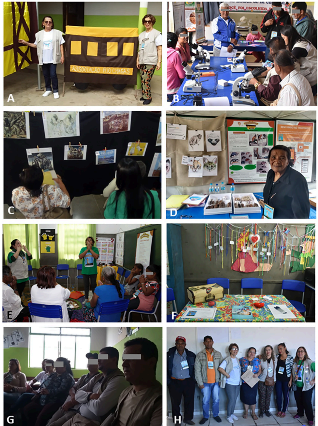
Fig 3. Images from each of the six wagons showing some thematic activities and strategic meetings: (A) wagon 1 with two members of Chagas disease from Rio Chagas Association that follow healthcare in Fiocruz (Rio de Janeiro); (B) wagon 2 with public observing parasites and insects under optical equipment; (C) wagon 3: re-readings of Portinari's artworks; (D) wagon 4: Biodiversit' Art activities showing animal reservoirs; (E) wagon 5: self-massage workshop with adults and children; (F) wagon 6: craft drapery pending the most important perceptions written or spoken by the participants; (G) mini-courses for health professionals to present the new clinical protocol and therapeutic guidelines for Chagas disease (PCDT-Chagas); (H) compromising participants to organize new associations of CD affected persons, in this case at the city of Grão Mogol during the activities of wagon 1 of Chagas Express XXI in July 2019.

https://doi.org/10.1371/journal.pntd.0009534.g003