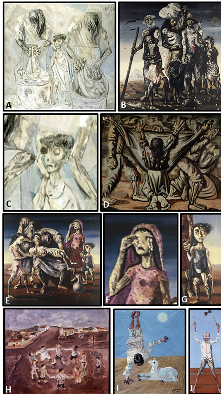
Fig 4. Images of some paintings of Candido Portinari presented to the participants in wagon 3: (A) “Washerwomen”, painted in 1944, size 170 x 200 cm; (B) “Retreatants”, painted in 1944, size 190 x 180 cm; (C) “Washerwomen”- detail of the central character with Romaña’s sign in the left eye; (D) “Burial in the hammock”, painted in 1944, size 180 x 220 cm; (E) “Dead Child”, painted in 1944, size 180 x 190 cm; (F) “Dead Child”-detail of woman with falling tears; (G) “Dead Child”-detail of a child character with Romaña’s sign in the right eye; (H) “Children circle”, painted in 1932, size 39 x 47 cm; (I) “Upside down”, painted in 1956, size 55 x 46 cm; (J) “Diabolo” (a game in which a two-headed top is thrown up and caught with a string stretched between two sticks), painted in 1959, size 154 X 75 cm. Their technical characteristics and museum locations are found in www.portinari.org.br .

https://doi.org/10.1371/journal.pntd.0009534.g004