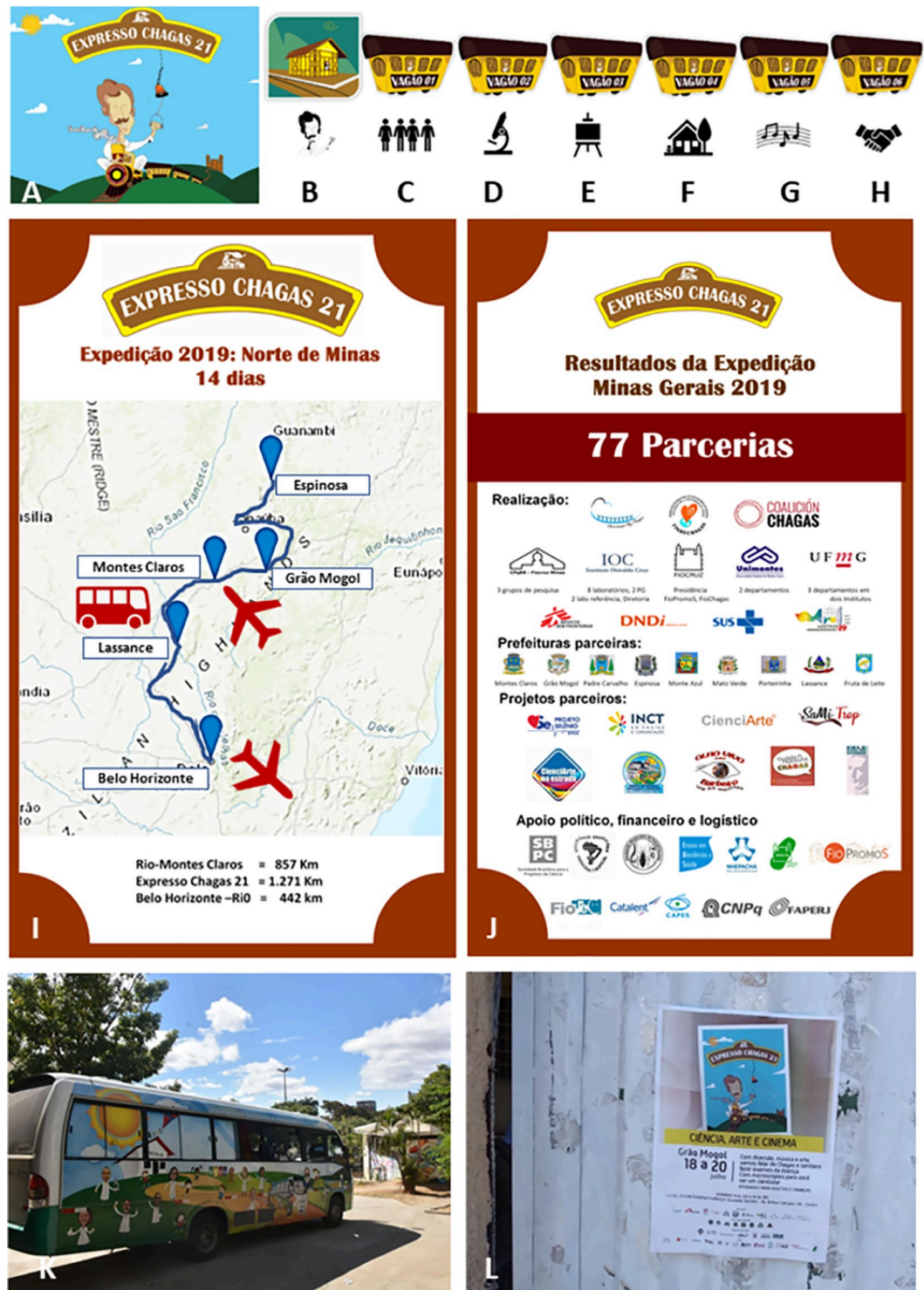
Fig 1. Materials and images of the Chagas Express XXI expedition to the northeast of Minas Gerais, Brazil, in winter vacation, July 2019. Art concept of Chagas Express XXI created by Erik J. Costa (A–J). The main pamphlet (A), the entry station (B) the successive wagons (C,D,E,F,G,H) and the general template of the banners (I,J) prepared as part of the exhibition composing expedition; the travel route and vehicles (prepared over a map that was in public domain - https://store.usgs.gov/map-locator ) (I) and partnership logos of the projects network, cooperating institutions and municipalities in the presentation of activities (J); mobile laboratory in the “Science on the Road” project bus that merged the team (K); local poster to publicize scheduled activities (L).

https://doi.org/10.1371/journal.pntd.0009534.g001