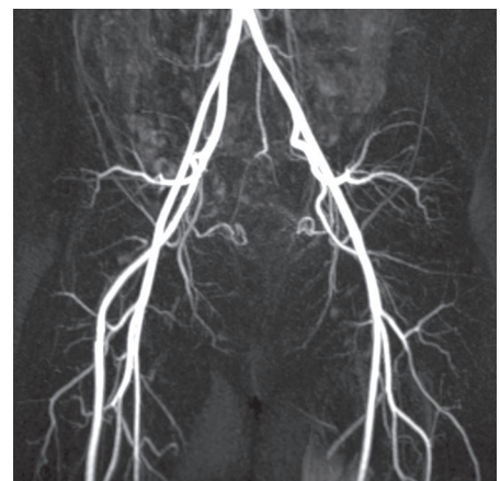
MR angiography showing a right persistent sciatic artery.

A 45-year-old female presented with claudication of the right lower extremity. Her ankle-brachial index (ABI) had dropped to 0.6. Angiography revealed an atypical course of the superior femoral artery without transitioning into the popliteal artery. The latter filled with contrast via collaterals in a delayed manner. We suspected a vascular anomaly. After probing the internal iliac artery, it was possible to pass a thrombotically occluded sciatic artery. We initiated local thrombolysis with 1 mg rtPA/h for 20 h. Follow-up angiography showed decreased thrombus burden with underlying stenosis of the vessel. This was treated with a stent. Angiographic magnetic resonance imaging (MR angiography) 6 days following intervention revealed continuity of the sciatic artery ( Figure ). Follow-up at 12 weeks showed normal ABI without reduced walking distance. Persistent sciatic artery is a rare anatomical variant that arises from the inferior iliac artery and normally regresses in favor of the femoral arteries. Due to poor vessel structure, the vessel is prone to vasculopathy.