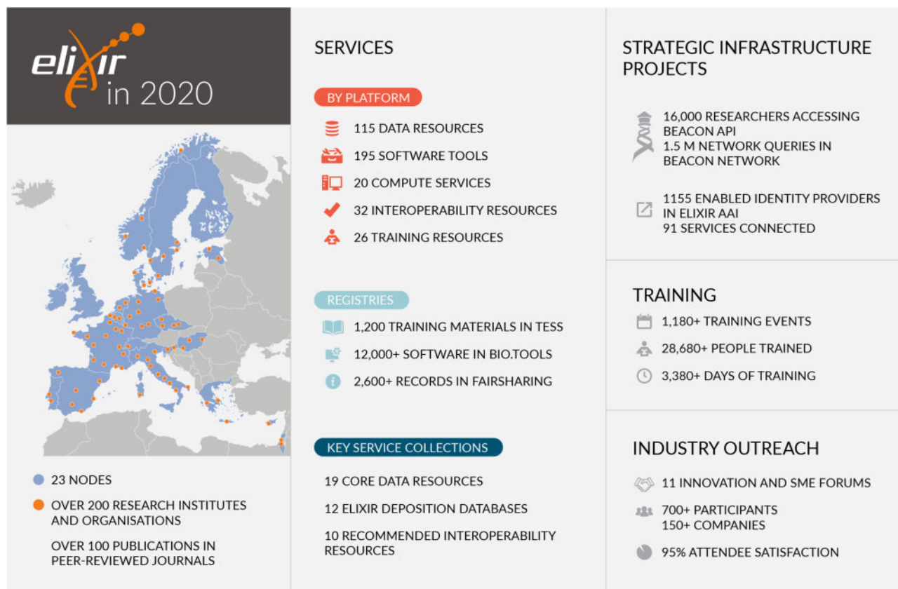
Fig. 1. Overview of the ELIXIR infrastructure including members, services, infrastructure, training and industry events

realized. For instance, access to open data and software has been shown to be of long-term value to the bioeconomy (Bousfield et al. , 2016; Rothe et al. , 2019). Industrial users of ELIXIR's services range from large multinationals to micro-Small and Medium Enterprises (SMEs), and include the pharmaceutical, healthcare, food, agriculture and blue biotech sectors. ELIXIR has shown that many SMEs extensively rely on life science data from public resources (Garcia et al. , 2018). ELIXIR aims to build new partnerships and strengthen existing collaborations (Lauer et al. , 2019) through its innovation and SME Forum, which has delivered 10 events over the first program, covering topics as diverse as Genomics and Health and Data-driven innovation in the agri-food industries.