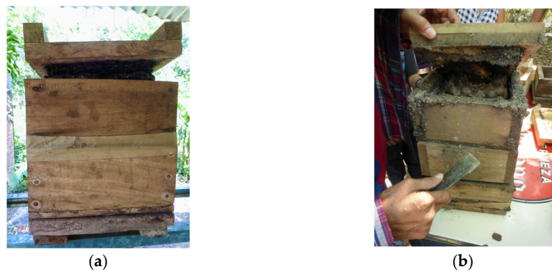
Figure 2. (a) Even in wooden box hives, many colonies seal cracks with a thick layer of propolis. (b) To access these colonies, beekeepers often use a hive tool to pry the lid from the hive body; excess propolis is sometimes lost in this process.

Some stingless bees use geopropolis in place of pure propolis. Geopropolis is a mixture of plant resins and soil. This mixture can consist of up to 90% soil, silt, and sand particles [56]. It is less malleable than pure propolis, but serves a similar function inside the nest [57]. Some studies use the terms propolis and geopropolis interchangeably, or state that geopropolis is the propolis of stingless bees [58], but these are actually distinct materials, differentiated by the presence or absence of soil [9].