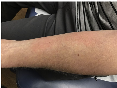
Fig 4. Patient 4. Erythematous patch involving the left arm.

but denied fever, pain, chills, and other systemic symptoms. Physical examination revealed bilateral erythematous exanthem on his arms (Fig 4). The rash responded to treatment with triamcinolone 0.1% cream twice daily and resolved after 2 weeks.