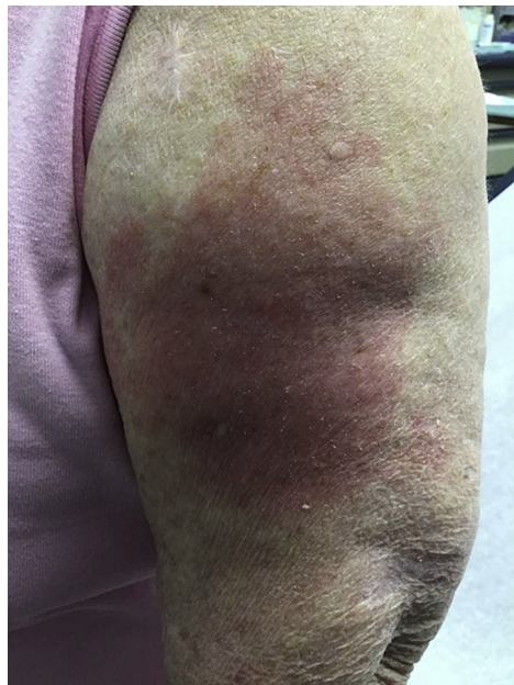
Fig 2. Patient 2. Erythematous rectangular patch localized to the vaccination site.

She did not have any associated fever, chills, or other systemic symptoms. The rash slowly improved with the administration of methylprednisolone 4-mg dose pack and continued levocetirizine 5 mg over a period of 4 weeks. The rash has mostly resolved with mild residual erythema, more prominent after a warm shower. The patient chose to proceed with her second vaccine dose 4 weeks later and did not experience any recurrence or flareup of the skin reaction.