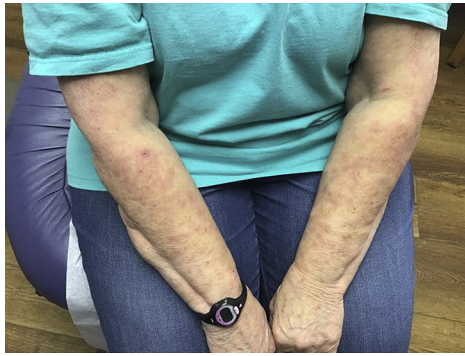
Fig 3. Patient 3. Severe morbilliform eruption involving both arms.