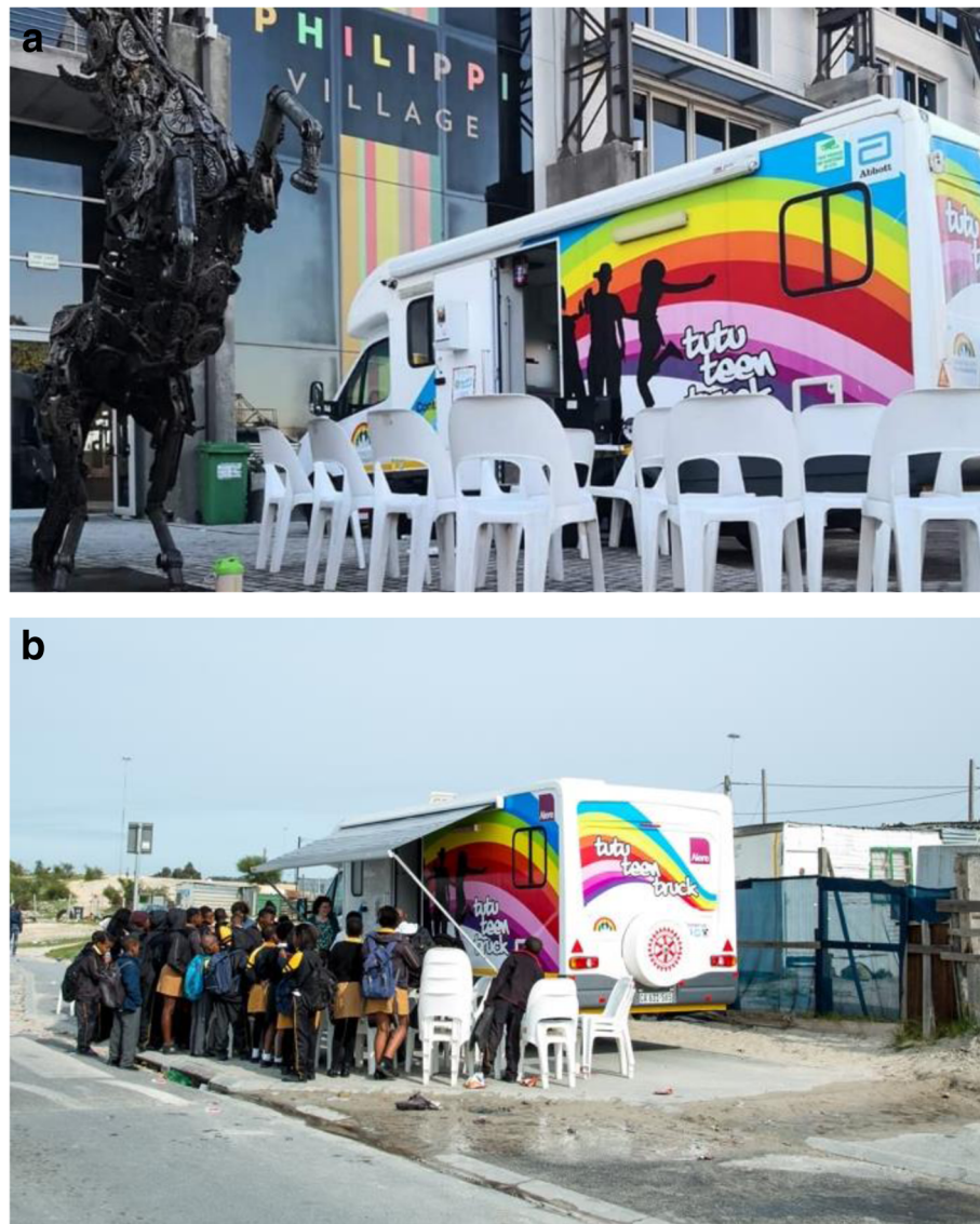
Fig. 1 a and b The Tutu Teen Truck mobile health clinic is a Mercedes Sprinter clinic conversion with private consultation rooms delivering services to adolescent and young people in densely populated, resource limited areas

PrEP delivery was integrated into the TTT sexual health services in July 2017 in consultation with the youth-CAB (community advisory board) to situate the specific intervention within communities largely naïve to PrEP as a biomedical HIV prevention method. AGYW self-presenting at the mobile clinic were invited to view an educational video 1 about HIV prevalence and risks in their community, and the effectiveness of PrEP for HIV prevention. During individual SRHS consultations, all HIV-negative AGYW were offered PrEP with the option to accept, delay, or refuse uptake. Point-of-care tests for HIV and pregnancy are conducted at every visit before