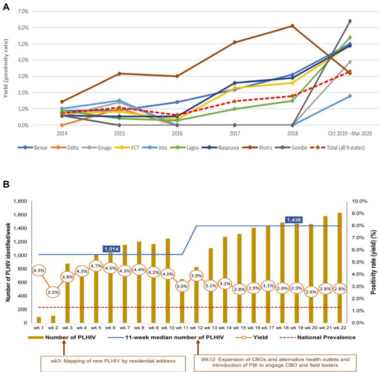
Figure 4 Community HIV positivity rate trend in nine states that implemented the enhanced community case-finding package (ECCP) as part of the Nigeria antiretroviral therapy surge. (A) 5-year (2014–2018) positivity rate trend by state versus Surge period (October 2019–March 2020). (B) Weekly positivity rate and number of newly identified PLHIV by state during the Surge (October 2019–March 2020).

Abbreviations: CBO, community-based organization; PBI, performance-based incentives; wk., week; PLHIV, People Living with HIV.