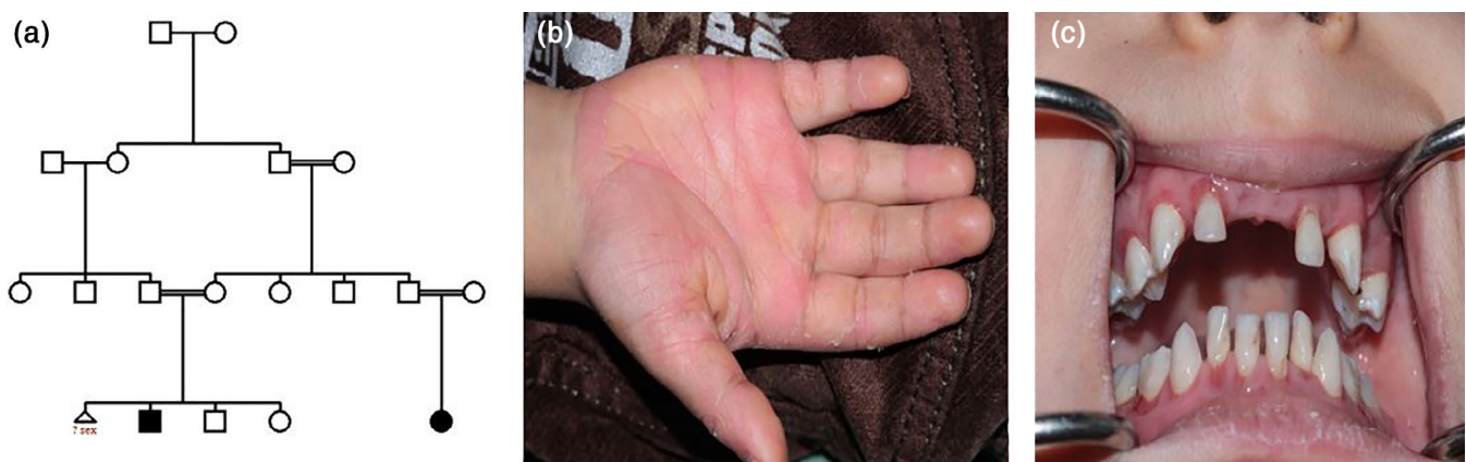
FIGURE 1 A 6-year-old boy as only affected one in his family; he has an affected cousin too. Pedigree (a) and clinical manifestation (b, c) have been shown here

Genetic testing of studied family revealed presence of the novel insertion in homozygous form in the third exon of CTSC gene