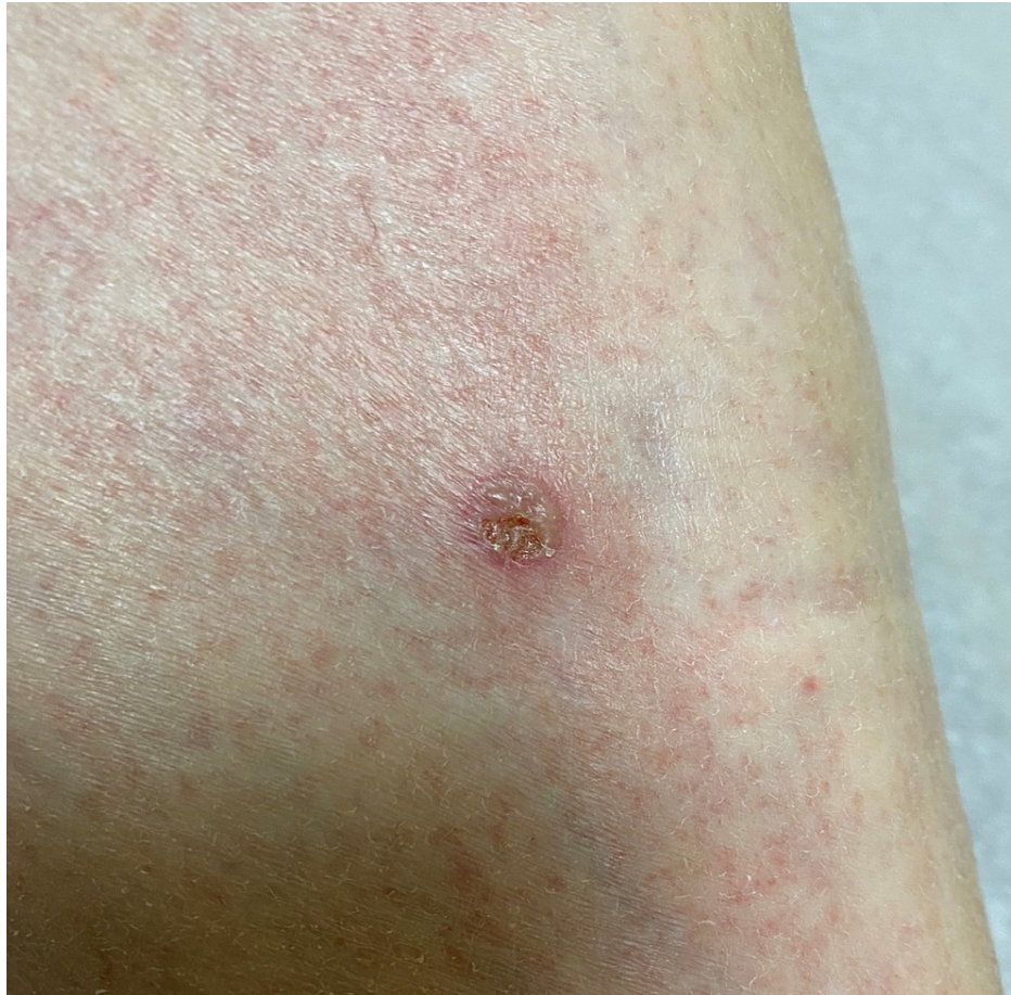
FIGURE 2: Round pink plaque over the left shin