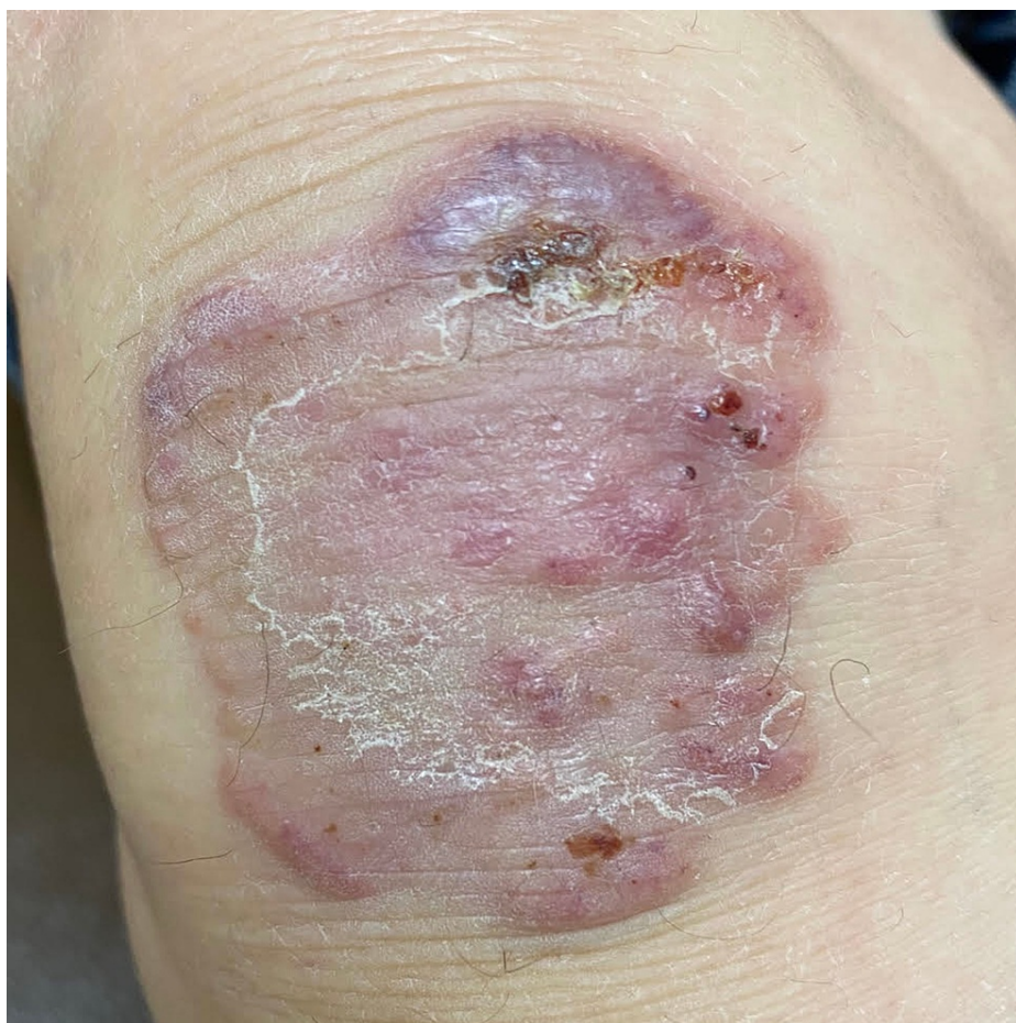
FIGURE 1: Pink/purple raised irregular texture of skin lesions of about 5 cm over the right knee

A 74-year-old male with a past medical history of hypertension, diabetes mellitus type 2, and benign prostatic hypertrophy was diagnosed with seropositive RA (rheumatoid factor and anti-cyclic citrullinated peptide-positive) three years ago. He had an initial clinical response to methotrexate but developed active inflammatory symptoms about a year into the treatment, which responded to short courses of steroids. Therefore, hydroxychloroquine was added to his regimen. He was also started on adalimumab about two years after the initial presentation. The patient had significant improvement of inflammatory joint symptoms after the first dose of adalimumab. However, after four doses, he started to have skin eruptions on his right knee, lower legs, feet, and right elbow. On examination, he had about 5-cm, pink/purple raised irregular texture of skin lesions over the right knee (Figure 1), round pink plaque over the left shin (Figure 2), two areas of similar dry, purple discolored skin lesions over the medial aspect of right foot (Figures 3a, 3b), two raised, round skin lesions with central, superficial ulceration over the right elbow, 1.5 cm in dimension with a boggy collection of fluid over right second PIP.