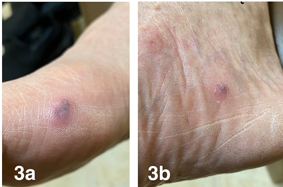
FIGURE 3: Two areas (3a and 3b) of similar dry, purple discolored skin lesions over the medial aspect of the right foot

The patient reported pain on his feet at the skin eruption site. He did not have recurring inflammatory joint pain. Adalimumab and hydroxychloroquine were discontinued, and he was started on an oral steroid taper