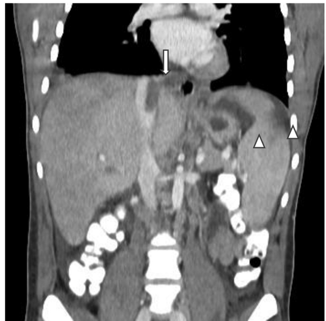
Figure 2. Inferior vena cava thrombosis and splenic infarcts. Filling defect in the inferior vena cava (arrow), and two splenic infarcts (arrowheads).

A routine echocardiogram performed prior to the initiation of induction chemotherapy revealed two cardiac masses, in the right atrium and ventricle (Figure 1A). The troponin level was normal and that of NT-pro-brain natriuretic peptide was mildly elevated (434 pg/ml, upper limit of normal=300 pg/ml). Chest and abdominal computed tomographic scans were ordered, and the patient was also diagnosed with a pulmonary embolism in a right lobar artery (accompanied by a right-sided pleural effusion), thrombosis of the IVC and