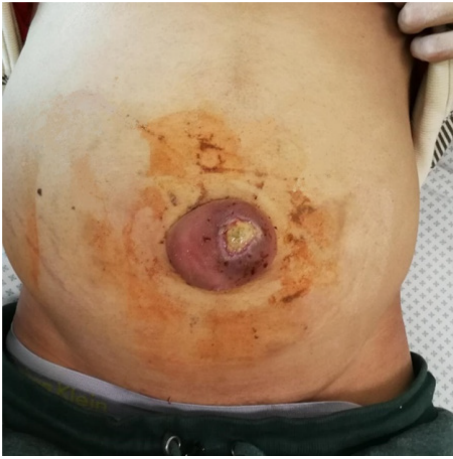
Figure 1 Flood syndrome. Infected ulceration of the ruptured umbilical hernia in a patient with ascites and liver cirrhosis.