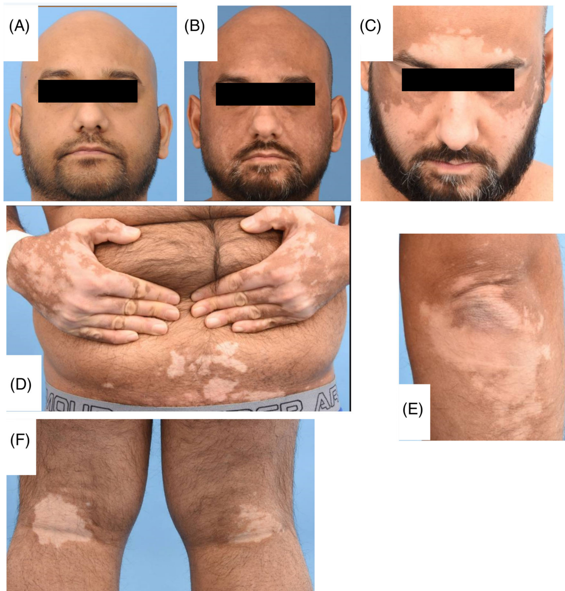
FIGURE 1 Photographs in case 1 showing (A) normal face pigmentation pre-nitisinone in 2014, (B) earlier facial vitiligo in 2017 and (C) more extensive vitiligo in 2020, (D) shows hand and trunk vitiligo in 2020, (E) shows vitiligo on extensor surface of elbow in 2020, and (F) shows bilateral popliteal fossa vitiligo in 2020

passed renal stones at age 27 years, dyspepsia, angina, generalized spondylosis affecting, cervical, thoracic and lumbar spine, with generalized joint pains. He is one of the siblings mentioned in case 1. He was 1.67 m and weighing 70 kg, with a blood pressure of 116/74 mm Hg. His medications consisted of buprenorphine patches, co-codamol, vitamin C, vitamin D, cetirizine, and beclomethasone cream. He was commenced on nitisinone 2 mg alternate days for 3 months and then the dose was increased to 2 mg daily. At the 2-year visit, an increase in skin pigmentation was noticed in the dorsal aspects of the thumb and middle finger of the right hand. At the 3-year visit, he mentioned increased discoloration of the skin in