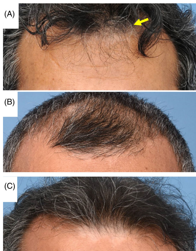
FIGURE 2 Photographs in case 2 showing vitiligo in forehead and scalp in (A) 2017, (B) 2018, and (C) 2019

vitiligo had extended to all over his body including the covered areas, forehead, armpits, around his groin and his left hand. Topical steroid cream made no difference.