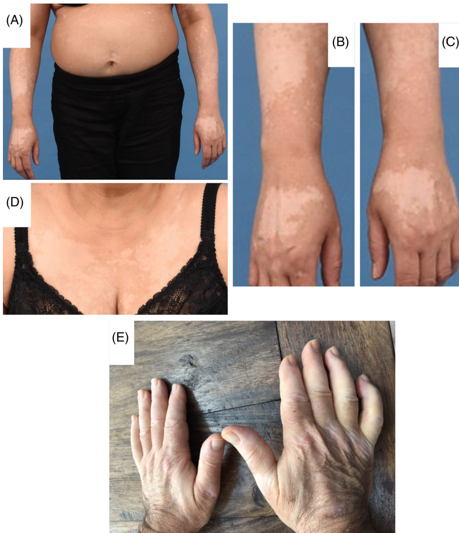
FIGURE 3 Photographs in case 3 shows vitiligo in 2018 on (A) trunk, (B) right hand, (C) left hand, and (D) front of chest wall. Photograph (E) shows vitiligo on hands in case 4

showing a nonsegmental distribution with a predominant acro-facial distribution. The prevalence of vitiligo has been reported around 1%. 17 The prevalence of vitiligo in AKU patients treated with nitisinone attending the hospital from which this report appears is 5% (4 out of 80 nitisinone treated patients). This may suggest that nitisinone-treated AKU patients may be at higher risk of developing vitiligo.