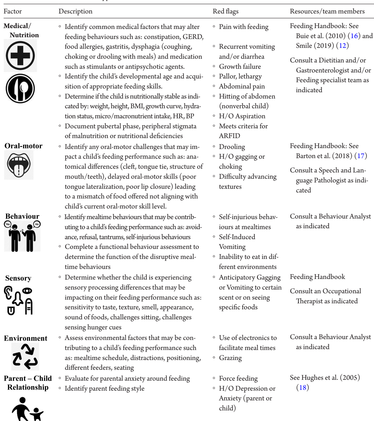
Table 1. The tenets of the MOBS E approach ©

Severe food selectivity: Consider if there is elimination of one or more food groups, consumes five or fewer foods.