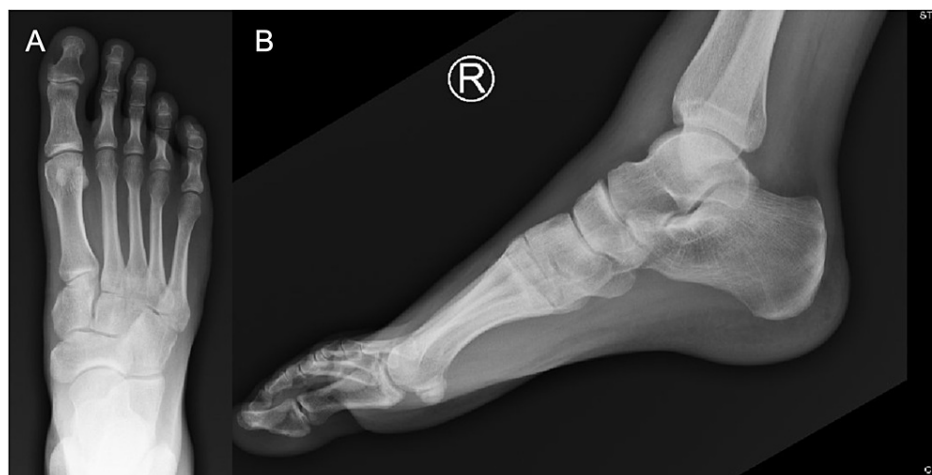
FIGURE 3: Anterior/posterior (A) and lateral (B) radiograph view of the right foot showing no evidence of fracture, gas, radiolucency, or opacity.

X-rays were negative for fracture, gas, radiolucency, or opacity (Figure 3).