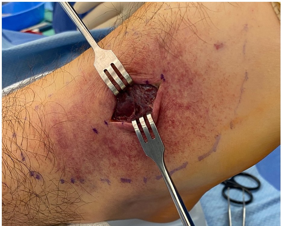
FIGURE 6: Intraoperative photograph of the right foot demonstrating the longitudinal incision and tense tenosynovium overlying the extensor digitorum longus tendons

In the operating room, a longitudinal incision was made over the dorsum of the anterolateral aspect of the right foot. The tense tenosynovium overlying the extensor digitorum longus was identified and incised in line with the incision (Figure 6).