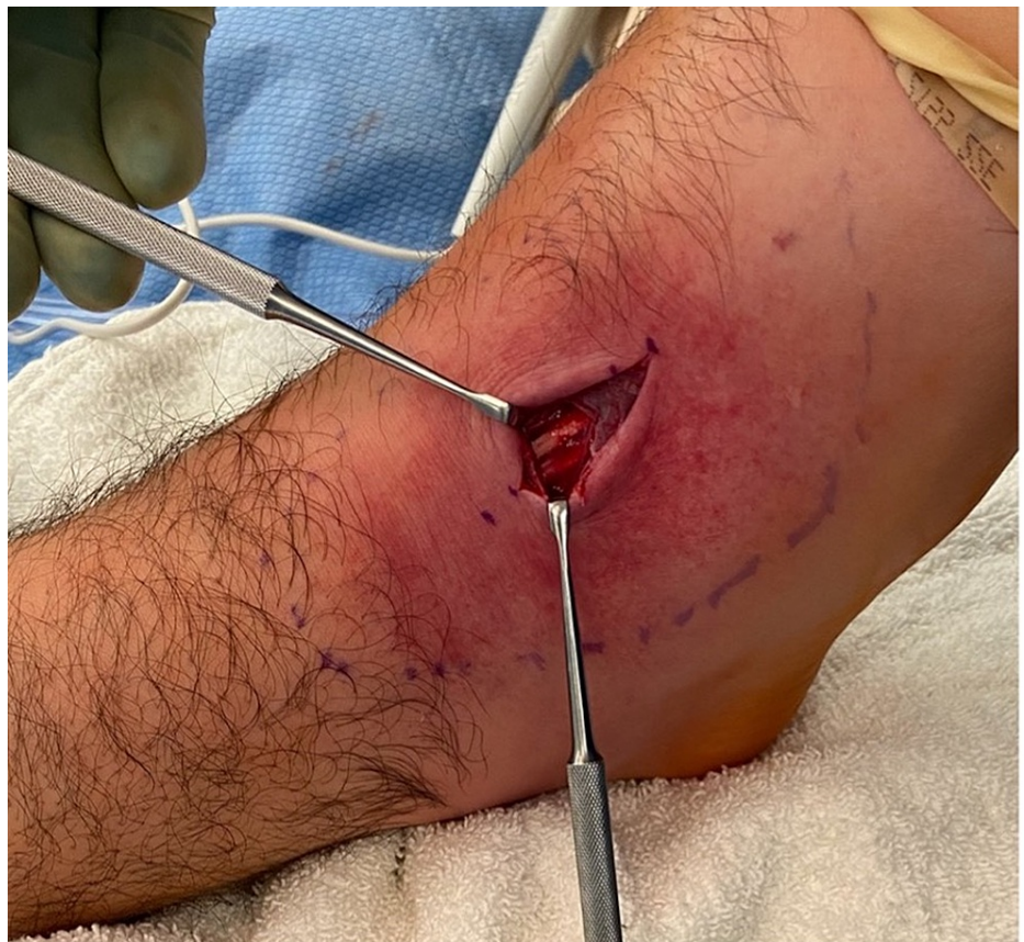
FIGURE 8: Intraoperative photograph of the right extensor digitorum longus tendon after cultures were taken