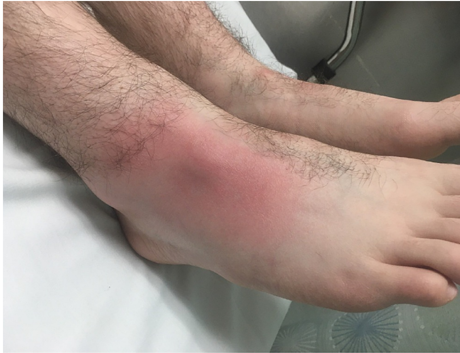
FIGURE 1: Emergency room photograph showing the right foot demonstrating an area of erythema over the dorsolateral aspect without any wounds or abrasions

He also demonstrated tenderness to palpation over the dorsolateral aspect without any deformity or fluctuance. He endorsed pain with passive flexion and extension of his lesser toes but no pain with passive range of motion of his ankle or subtalar joint. The patient was distally neurovascularly intact. On thorough examination, there was also no frank evidence of any trauma or abrasions elsewhere on his body.