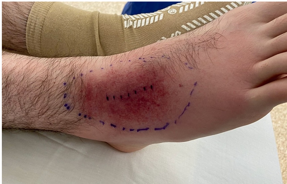
FIGURE 5: Preoperative photograph of the right foot demonstrating planned incision site in relation to margins of infection

In the operating room, a longitudinal incision was made over the dorsum of the anterolateral aspect of the right foot. The tense tenosynovium overlying the extensor digitorum longus was identified and incised in line with the incision (Figure 6).