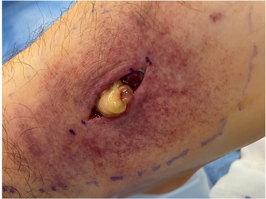
FIGURE 7: Intraoperative photograph of the exposed phlegmon present within the extensor digitorum longus tendon sheath