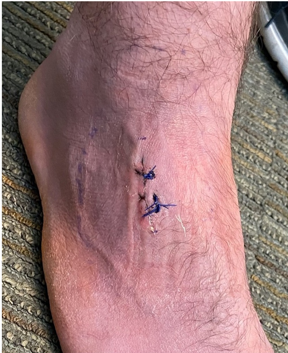
FIGURE 9: Postoperative day nine photograph of the right foot demonstrating resolution of erythema and clean, dry, and intact incision site.

At his nine-day postoperative clinic evaluation, his erythema had completely resolved, and his incision looked clean, dry, and intact (Figure 9).