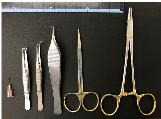
Figure 1. Surgical instruments used in this protocol