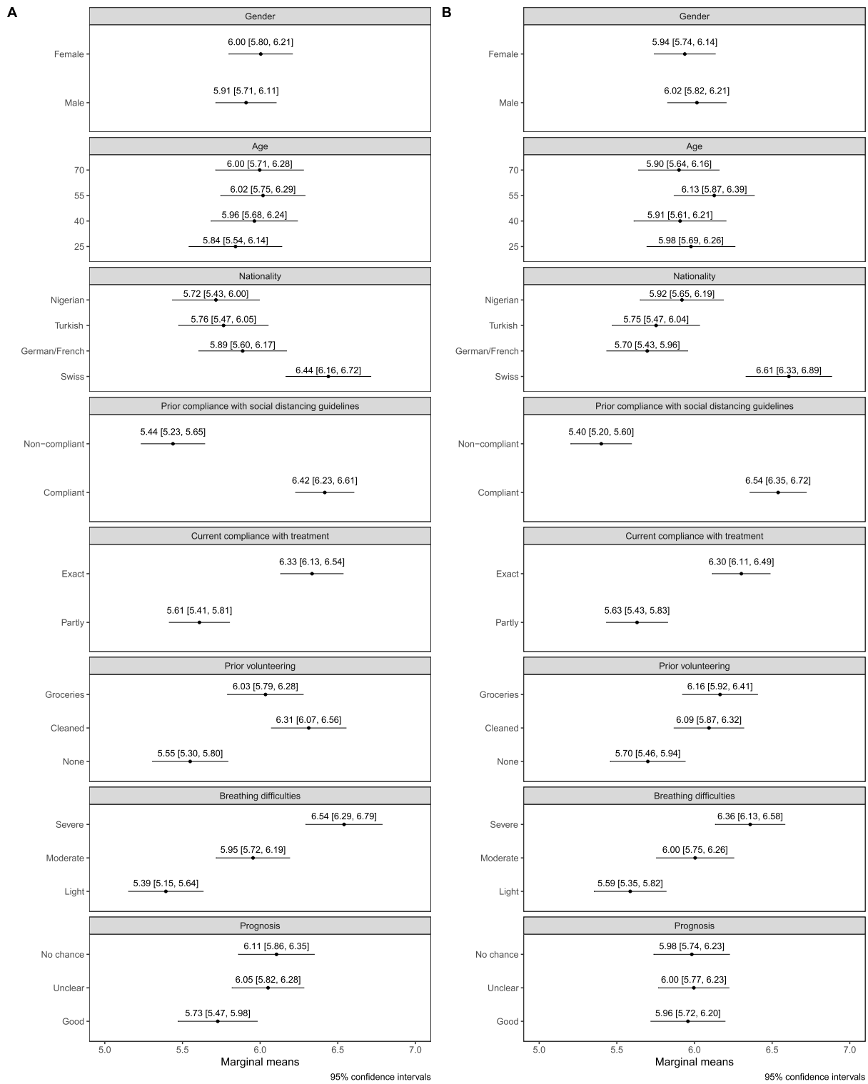
Fig. 2. Marginal average priority ratings.

matter (see the Supplement for the detailed figures).