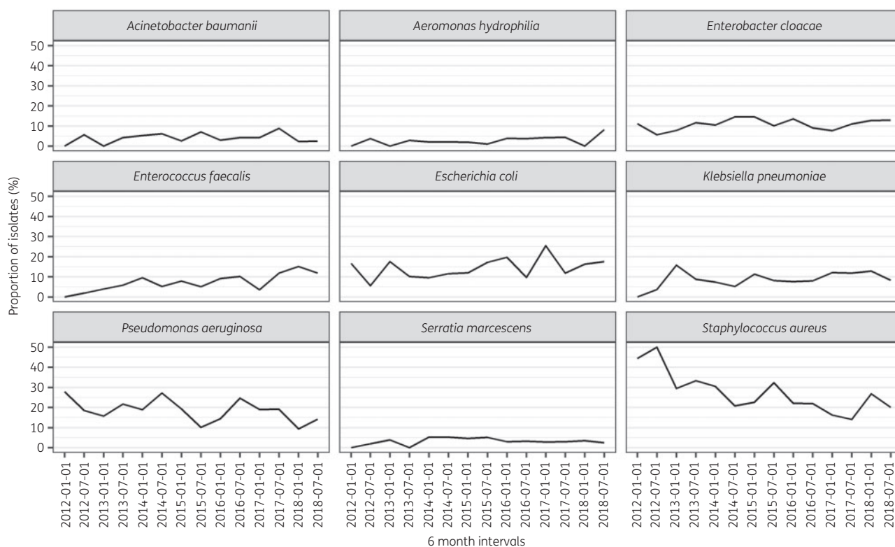
Figure 1. Evolution of detection of the most frequent nine bacteria over 6 monthly intervals between 2012 and 2018 at the MSF Nap Kembe Trauma Hospital, Tabarre, Haiti.