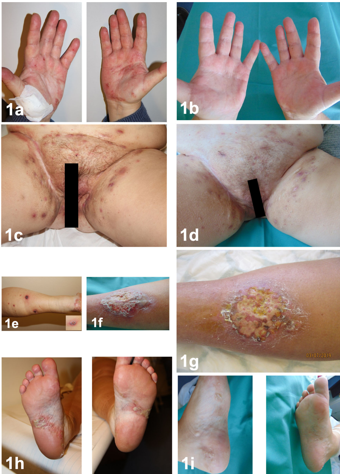
Figure 1. palmar psoriasis before (1a) and after (1b) treatment with secukinumab over 4 months. Manifestations of HS localized in the inguinofemoral region before (1c) and after (1d) treatment. Pyoderma gangrenosum two months after adalimumab discontinuation (1e), clinical image 4 months after secukinumab treatment (1f) and post-prednisolone i.v pulse therapy (1g). Plantar pustulosis before (1h) and after secukinumab treatment (1i).