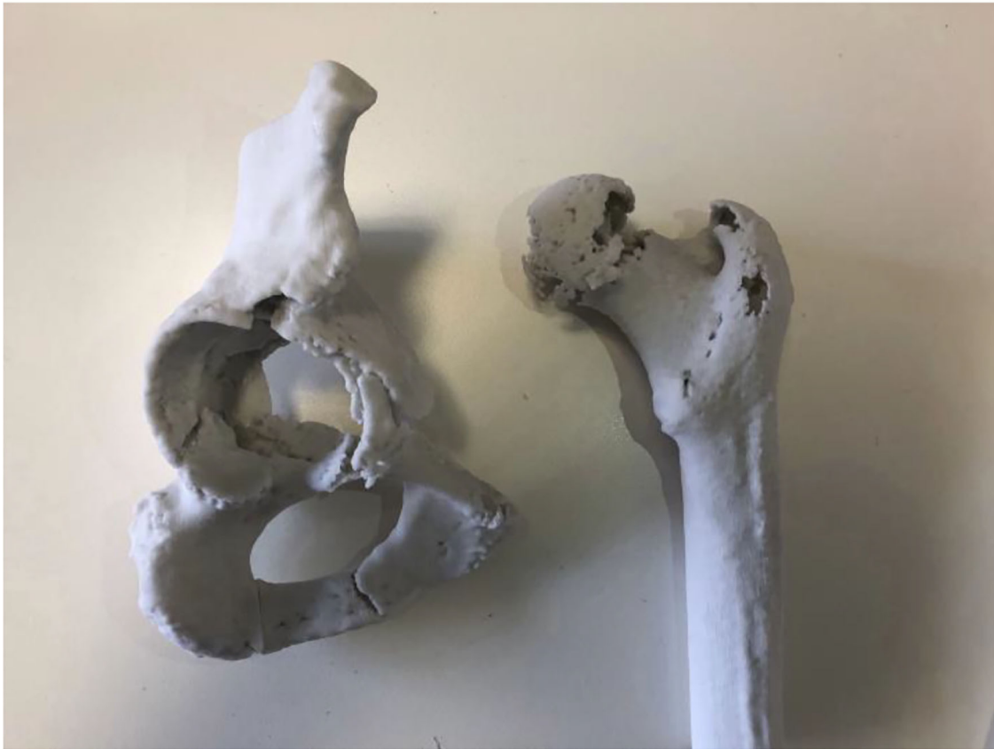
FIGURE 2 | Plaster model from Case 4 showing an acetabular fracture with anterior column discontinuity. Despite the anterior column disruption it was shown that the posterior column was intact and stable, allowing for screws to be placed in the posterior and superior aspects of the cup to stabilise the construct without need for augments or cages.

procedure. The operation becomes streamlined as the optimal alignment and positioning of the ream along with the fit and orientation of the implant is being recreated instead of discovered. Stress inducing questions such as if increasing the size of the ream will improve the fit or cause a wall blowout, which obstructing anatomy can be removed, and if a non-conventional fixation is sufficient or will cause impingement have already been answered, giving the surgeon the confidence to proceed with their predetermined plan. The reduction in stress related to operative uncertainty can also be communicated to the patient, informing them of the risks associated with their complex procedure and the steps taken to mitigate the complications. Our study found these factors positively impacted surgical preparation from both a clinician and patient perspective.