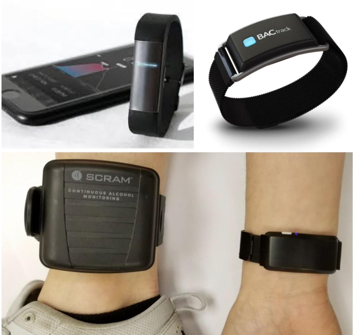
Figure 1. Top panel displays two new generation transdermal wrist sensors—Milo (left) and BACtrack (right). Bottom panel displays old-generation (AMS SCRAM; left) and new-generation (BACtrack Skyn prototype; right) devices to scale, side by side. Bottom panel adapted from (10).