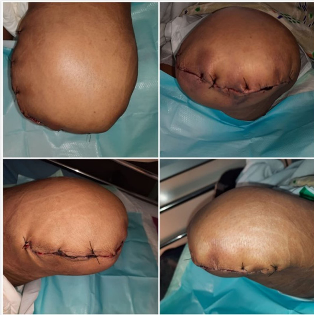
Figure 3. The appearance of left lower limb post amputation. Two days post-surgery, the patient was safely discharged and followed up regularly for recurring symptoms at the outpatient clinic.

Hb 10.3, leucocyte count 22610/ \mu L, platelet 509000/ \mu L, D-dimer 3960 ng/ml and random blood glucose of 171. Subsequently, the patient received 8 lpm oxygen through a simple mask, diet type-B 1900 kcal/24 hours, iv fluid with NaCl 0.9% 1000 ml/24 hours, cefoperazone sulbactam 2 \times 1 g iv, subcutaneous novorapid 14 – 16 – 16 unit, subcutaneous levemir 0 – 0 – 10 unit, subcutaneous heparin 2 \times 5000 unit and oral cilostazol 1 \times 100 mg. At day 13, her blood pressure was 127/70 mmHg, heart rate 90 bpm, respiratory rate 20 times/minute and SpO 2 98%. Laboratory results showed Hb 9, leucocyte count 11800/ \mu L, platelet 410000/ \mu L, BUN 20 mg/dl, serum creatinine 1.3 mg/dl and random blood glucose of 160. The eGFR was 45 ml/min/1.73 m 2 (stage 3A). At this point, the patient was assigned for antegrade right femoral artery thrombectomy and left above-knee amputation at the following day. At day 14, the surgeries (both amputation and thrombectomy) were performed (Figure 3) and 10 cm thrombus was retrieved in the right femoral artery. Lastly, as a follow-up, at day 17, no symptoms were observed, therefore the patient was discharged.