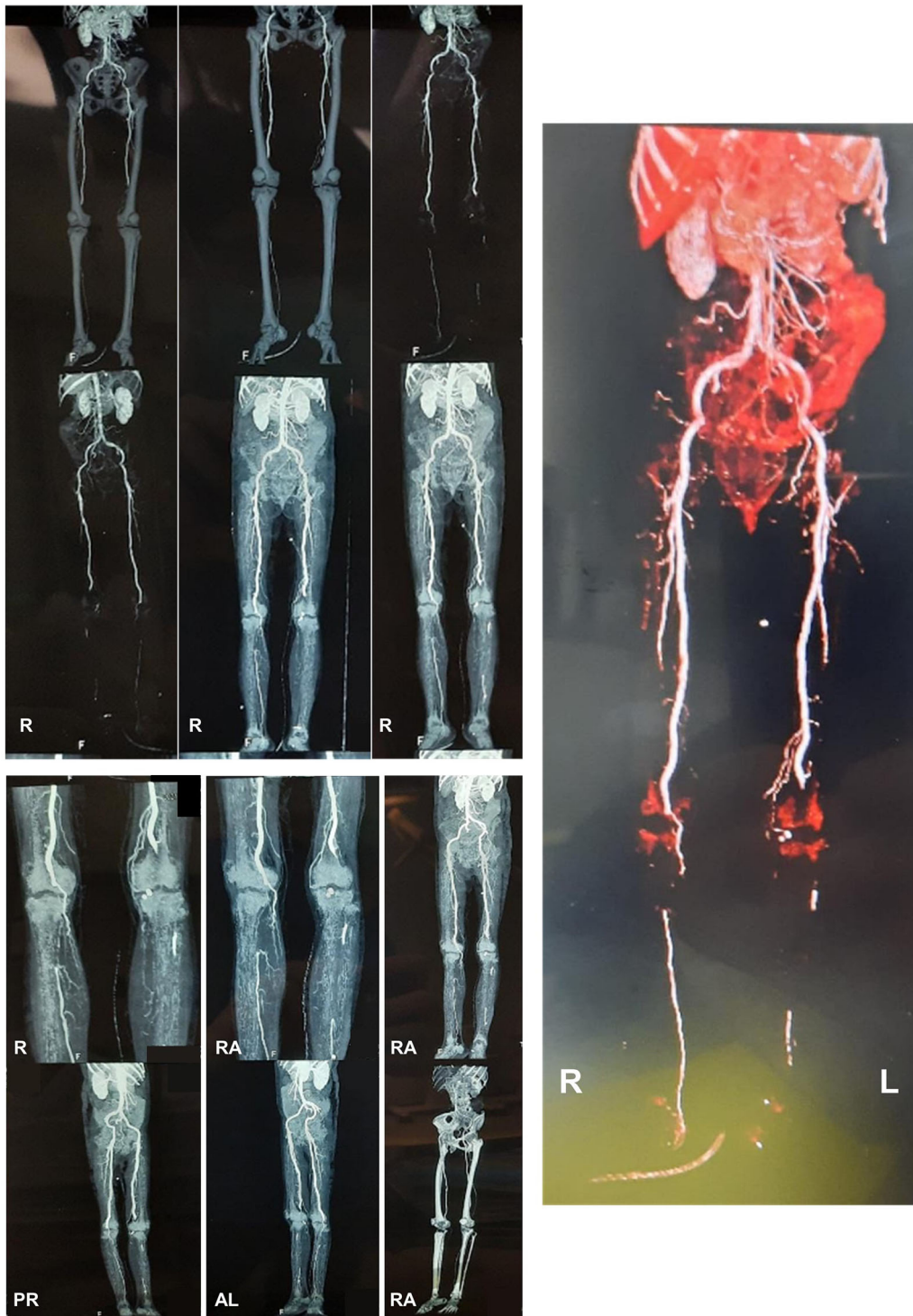
Figure 2. The computed tomography angiography (CTA) of the lower extremity. The CTA revealed an abdominal aortosclerosis with abnormalities on both limbs. Right limb: total occlusion due to 6 cm thrombus on right popliteal artery (from 1 cm above right femorotibial joint toward inferior), right anterior tibial artery received contrast flow from collateral arteries and no contrast flow was seen in right posterior tibial, peroneal and dorsalis pedis arteries. Left limb: total occlusion due to 12.7 cm thrombus on left popliteal artery (from 6 cm above left femorotibial joint toward inferior). No contrast flow was seen in left anterior tibial, posterior tibial, peroneal and dorsalis pedis arteries. (This figure has been edited in Microsoft PowerPoint 2016 to obscure patient's data.)