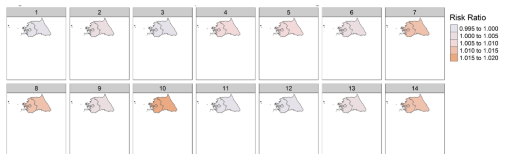
Figure 2. Association between DTR and amputation of diabetic foot in region 1.

The results from the subgroup analyses in region 1 (Seoul, Incheon, Gyeonggi-do, and Gangwon-do) are shown in Table 2 and Figure 2. Increasing DTR was associated with a higher risk of amputation in most lag days. On the 10th and 14th lag day, the association was statistically significant (10th lag day: 1.017 [1.007–1.027]; 14th lag day: 1.012 [1.002–1.022]). The results in region 2 (Busan, Ulsan, Gyeonsannam-do, Gwangju, Jeollanam-do, Jeollabuk-do, and Jeju-do) are shown in Table 3 and Figure 3. Differing from the results in region 1, there was no significant association between DTR and the amputation of diabetic foot, with the exception of the 3rd lag day (3rd lag day: 0.976 [0.961–0.992]).