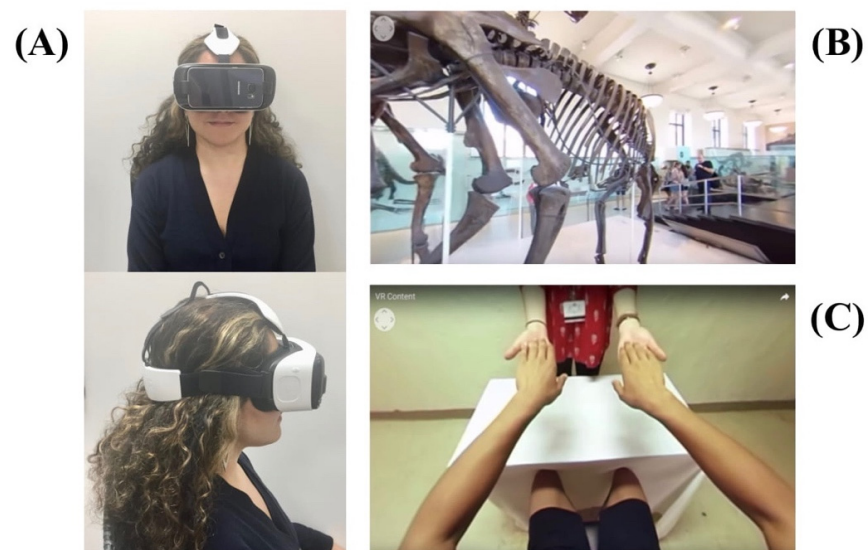
Figure 1. Virtual reality setup for the somatic and scenery virtual environments. (A) Samsung Gear virtual reality headset frontal (top) and side view. (B) Scenery virtual environment: participants are shown scenes that do not involve somatic interaction with the painful limb (in this case a scene taken from the Museum of Natural History). (C) Somatic virtual environment: participants are shown scenes that involve functional movements of the upper and lower limbs. Written informed consent was obtained from the individual for the publication of this image.

and somatic, where the VE consisted of upper and lower extremity movements (Figure 1). Two types of somatic environments were used, and participants chose the most appropriate environment based upon their self-reported location of their most prominent pain: an upper extremity VE or a lower extremity VE. While viewing the VEs, no specific commands were given, and participants were not encouraged to focus on any particular part or element of the VE. Patients underwent the two consecutive VR sessions (scenery and somatic) in a randomized order. Each VR session was 10 min in duration. The participant was permitted to leave the laboratory and move freely within the campus (in some cases for several hours) and return for the second VR session once the participant reported a return to baseline pain level.