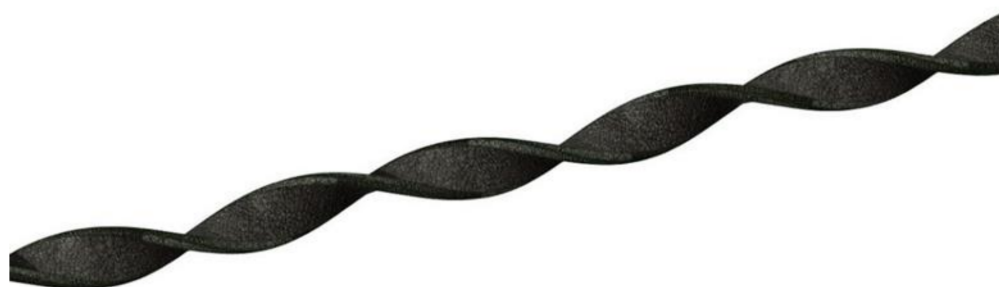
Figure 1. Pili torti, characterized by the presence of the hair shaft flattened and twisted 180° along its long axis. Reproduced with permission from J. Taczała, MSc.

In this review, we analyse current data about the possible causes of pili torti and discuss the underlying conditions. Available data on the management of pili torti are presented.