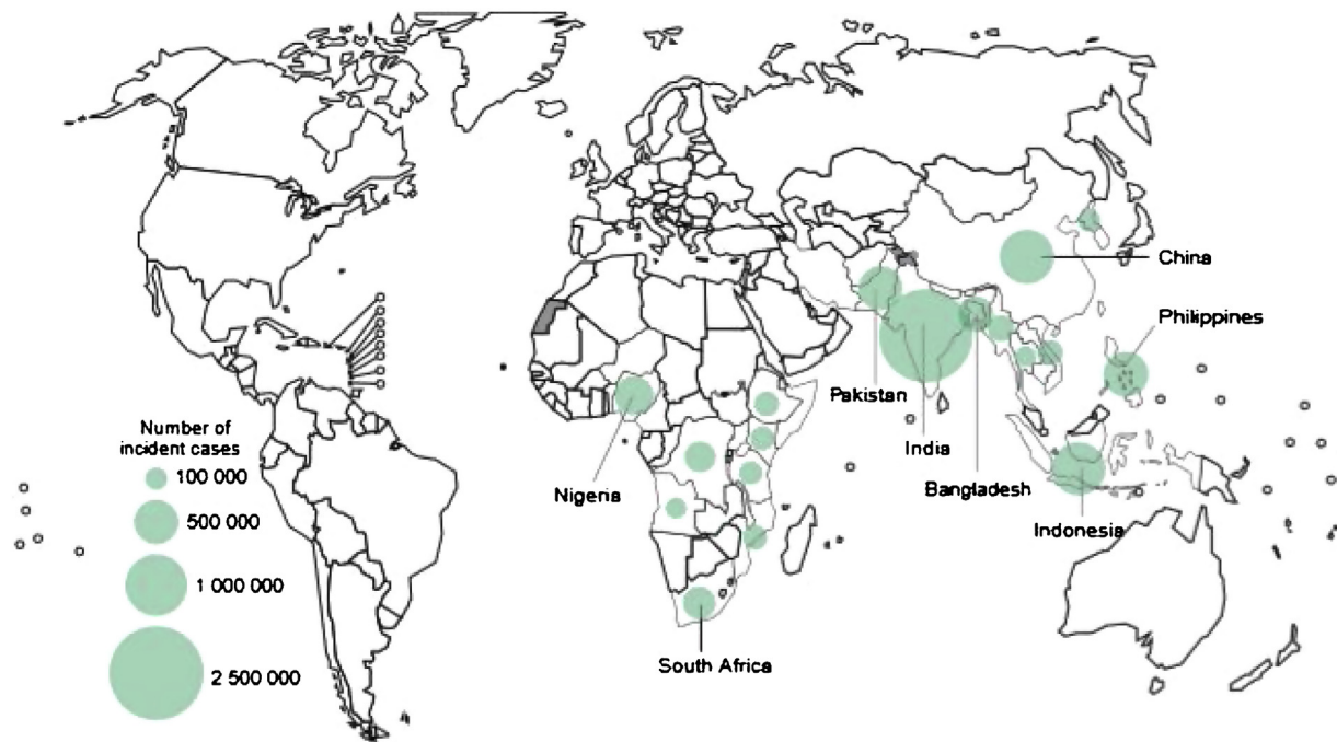
Fig. 1. Estimated incidence of TB in 2018, for countries with at least 100,000 incident cases.

Initially, Mycobacterium tuberculosis , the aetiological agent of TB, causes Latent Tuberculosis Infection (LTI) and only a small proportion of these patients (5–10%) will develop the disease in their lifetime. The WHO considers that the main risk factors for this are malnutrition, HIV infection, alcoholism, smoking and diabetes 3 . Other diseases or immunosuppressive treatments and advanced age could also play a role.