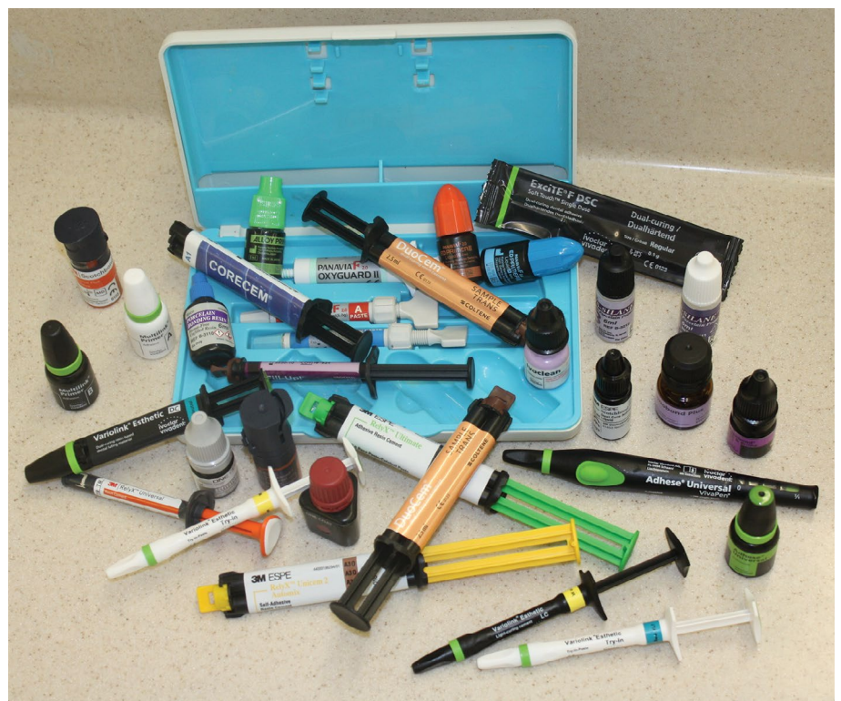
Fig. 1 A small sample of the many adhesive cementation systems available for indirect restorations

In general, adhesive cementation can be considered when: