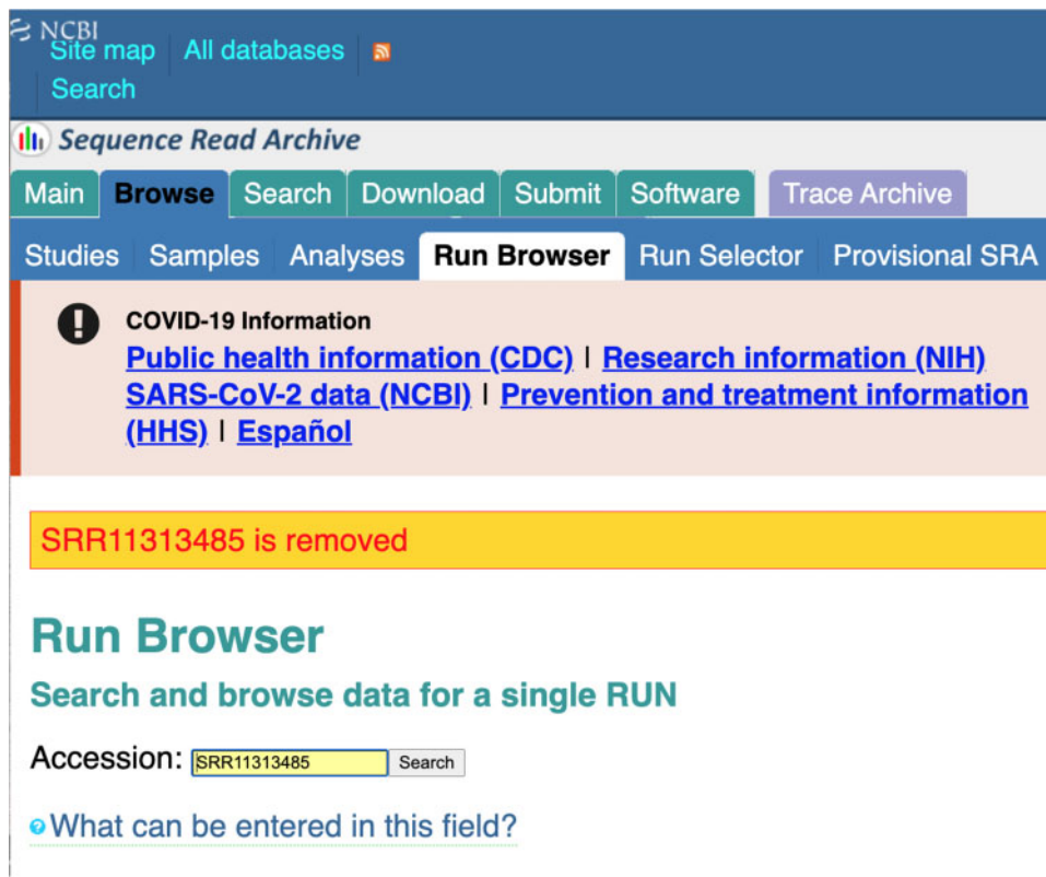
FIG. 1. Accessions from deep sequencing project PRJNA612766 have been removed from the SRA. Shown is the result of searching for “SRR11313485” in the SRA search toolbar. This result has been digitally archived on the Wayback Machine at https://web.archive.org/web/20210502131630/https://trace.ncbi.nlm.nih.gov/Traces/sra/?run=SRR11313485 .