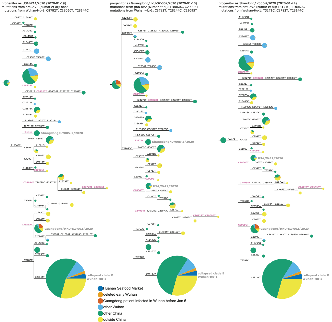
Fig. 5. Phylogenetic trees like those in fig. 3 with the addition of the early Wuhan epidemic sequences from the deleted data set, and Guangdong patients infected in Wuhan prior to January 5 annotated separately. Because the deleted sequences are partial, they cannot all be placed unambiguously on the tree. Therefore, they are added to each compatible node proportional to the number of sequences already in that node. The deleted sequences with C28144T (clade B) or C29095T (putative progenitor in middle tree) can be placed relatively unambiguously as defining mutations occur in the sequenced region, but those that lack either of these mutations are compatible with a large number of nodes including the proCoV2 putative progenitor. Supplementary figs. S4 and S5, Supplementary Material online, demonstrate that the results are identical if RpYN06 or RmYN02 is instead used as the outgroup.

plausible identities for the progenitor of all known SARS-CoV-2. One is proCoV2 described by Kumar et al. (2021) , and the other is a sequence that carries three mutations (C8782T, T28144C, and C29095T) relative to Wuhan-Hu-1. Crucially, both putative progenitors are three mutations closer to SARS-CoV-2's bat coronavirus relatives than sequences from the Huanan Seafood Market. Note also that the progenitor of all known SARS-CoV-2 sequences could still be downstream of the sequence that infected patient zero—