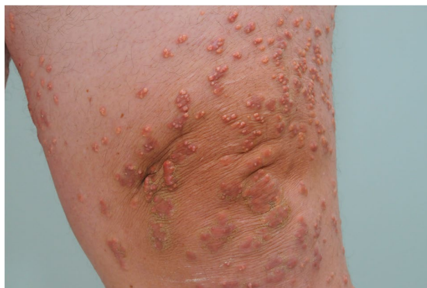
Fig. 2 Eruptive xanthomas. Eruptive xanthomas associated with hyperchylomicronemia (image shared with patient's permission [on file])

In addition to HTG-AP, individuals with FCS report abdominal pain without the diagnosis of AP as a common complaint, as well as other non-specific gastrointestinal, neurocognitive, peripheral neuropathy, depressed mood, and other effects [67].