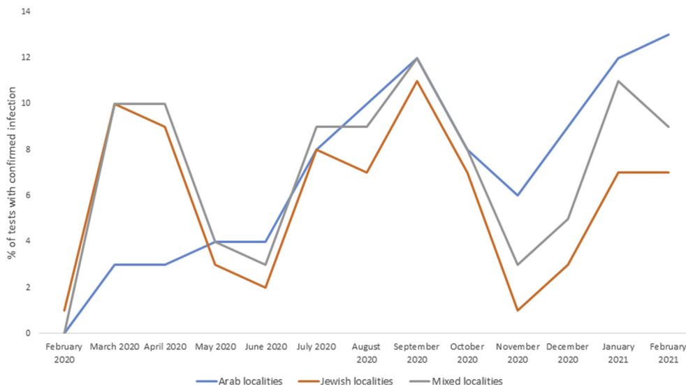
Fig. 1. Positivity rate of COVID-19 tests (percentage of tests with confirmed infection), by population group and month, February 2020–February 2021.

which were only 15% of the rates seen in Jewish localities. The initial advantage seen in the Arab population gradually diminished to almost identical rates (0.97 of the Jewish rates) in August 2020. By September, mortality was twice as high in Arab localities compared with Jewish localities. In subsequent months (except October), mortality in Arab localities was slightly higher or similar compared with Jewish and mixed localities.