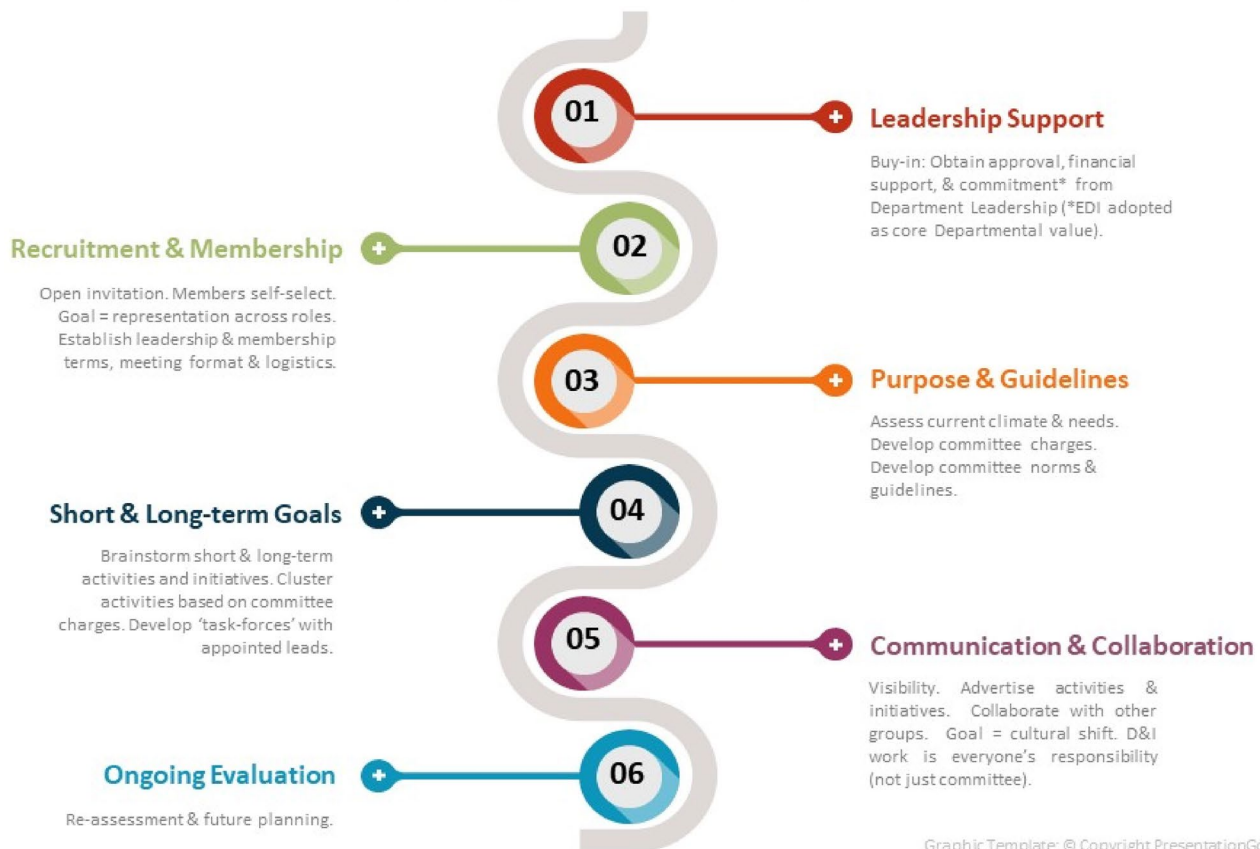
Fig. 1 A model for developing a Departmental Diversity, Equity, and Inclusion (DEI) Committee

of and focus on racial disparities between white and BIPOC (Black, Indigenous, and people of color) members of society across an array of health and safety outcomes, gave new light to the public health crisis of racism in America (Devakumar et al., 2020). Along with a national and global society, our local community reckoned with the resulting civil unrest and racial trauma (Comas-Díaz, Hall, & Neville, 2019) experienced by many BIPOC individuals. In addition to the COVID-19 pandemic, many fields began to recognize and explicitly name the concurrent “racism pandemic” (e.g., APA, 2020) that resulted in far reaching disparities across various health and safety outcomes on children and families of color. Layered on top of the COVID-19 pandemic, the constellation of these events resulted in “dual pandemics.” Within our academic department, the timing (and location) of these historic events provided an important opportunity for deeper conversations, increased buy-in, and stronger commitment to existing DEI efforts spearheaded by our committee. Below (Step 5, Lessons Learned), we describe the specific impacts of these events further as well as the