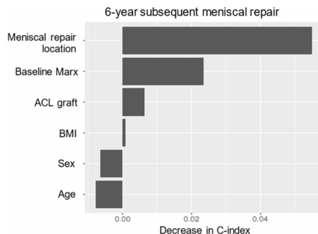
Figure 3. Relative variable importance by the decrease in bootstrap-validated concordance probability (C-index) upon removal from the full model. ACL, anterior cruciate ligament; BMI, body mass index.

Our multivariate analysis revealed no significant relationship between meniscal repair failure and patient age at the time of index surgery. Among patients with a failed meniscal repair, the distribution of age was similar across the BTB autograft (18 years; IQR, 15-22 years), soft tissue autograft (18.5 years; IQR, 15-27 years), and allograft (17 years; IQR, 16.5-33.5 years) groups. However, age appeared to be more widely distributed among all patients