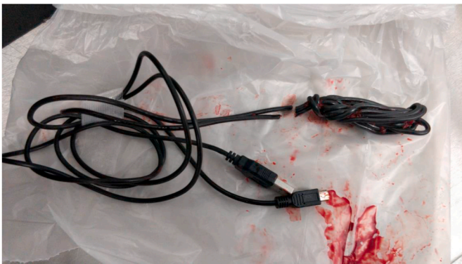
Fig. 2. Post-surgical removal of the cable.