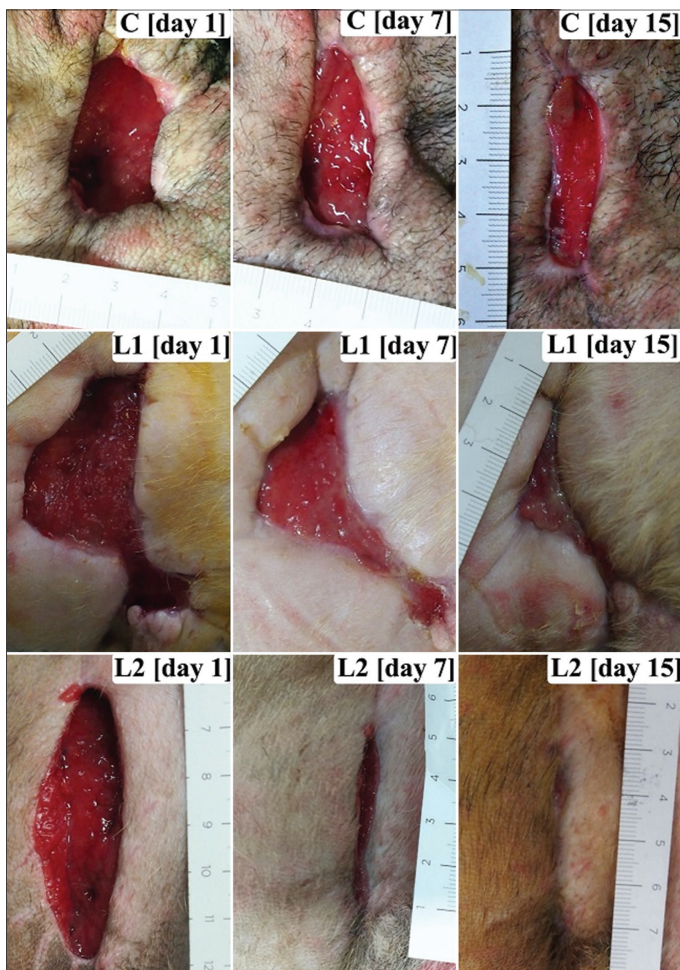
Figure-1: Wound photographs showing the variety of the initial wound area of clinical cases. The percentages of wound area reduction of photobiomodulation therapy (PBMT) groups (L1 and L2) were significantly higher than the non-PBMT group (C) from days 7 to 13 after beginning the treatment ( p < 0.05 ).

PBMT with a fluence of 3-4.2 J/cm 2 [32,33]. In clinical case reports, human venous ulceration wounds treated with 830 nm PBMT with a dose of 9 J/cm 2 [34] and chronic dog wounds treated with the use of a single 630 nm wavelength PBMT with a fluence of 5 J/cm 2 [28] exhibited more rapid wound area reduction. This potentially confirms in vitro studies showing that PBMT improved biological immune response by increasing the migration of primary cytokines (interleukin-1 \beta [IL-1 \beta ], tumor necrosis factor- \alpha , IL-6, and MCP-1) [35], neutrophil and macrophage infiltration [36], angiogenesis, fibroblast and collagen