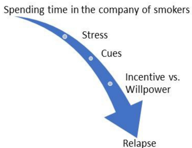
Figure 1 A scenario that induces a smoking relapse.

former smoker would spend time among smoking acquaintances, he/she would experience positive or negative emotions, and cues would appear. Then, insufficient willpower to avoid succumbing to these indirect or direct incentives, sometimes additionally weakened by alcohol consumption, led to a relapse (Figure 1).