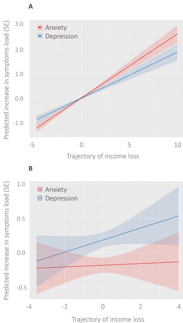
Fig. 2. Associations between one-month trajectories of objective financial hardship (income loss) and anxiety and depressive symptoms in longitudinal assessment. Caption. (A) Cohort 1 and (B) Cohort 2. X-axis represents change in income loss from T1 to T2, regressed for T1. Negative values on the x-axis indicate that participants reported income loss the first time (T1), and then by the second time (T2), they reported milder income loss. y-axis is standardized (z) symptom load.

maintaining balance between necessary social distancing and minimization of economic slowdown. In addition, our findings can guide clinicians as they encounter patients during the pandemic, suggesting that healthcare providers should actively probe patients for a change for the worse in their income, and ask them specifically about their subjective stress regarding the financial impact of COVID-19. Our results may suggest that these financial stressors are sensitive markers for the development of depression. Importantly, our results suggest that the impact of income loss and financial strain on depressive symptoms are independent of pre-COVID-19 income. We therefore suggest that people from all backgrounds who report stress about their financial situation during the pandemic, including those with high income, are vulnerable to the effects of the financial crisis on mental health, and therefore no one should be overlooked for their increased risk for depression.