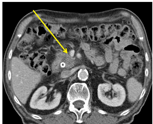
FIG. 1. Pancreatic tumor with a PV/SMV contact smaller than 180^\circ without deformity (arrow) in a patient undergoing pancreaticoduodenectomy without vein resection after neoadjuvant treatment. The final pathology showed the presence of malignant cells at the SMV/PV margin (R1 resection). SMV, superior mesenteric vein; PV, portal vein

During the last decade, improvements in imaging tools and techniques have strengthened the crucial role of the radiologist in PDAC management. Development of high-resolution imaging with thin-slice thickness and multiplanar reconstruction allows better analysis of tumoral extension and the tumor–vessel interface. Magnetic resonance imaging (MRI) performed with specific sequences appears to be very promising, especially in combination with metabolic imaging and conventional CT. 24,25 Diffusion-weighted MRI can identify responding patients upon PDAC restaging after NAT thanks to apparent diffusion coefficient-mapping by monitoring of treatment-induced changes in PDAC and also is more sensitive than CT for imaging of small PDAC liver metastases (83% vs 45%). 23,25 In our opinion, MRI should be prospectively incorporated as part of PDAC staging and restaging after NAT, especially for vascular contact (re)assessment and tumoral changes.