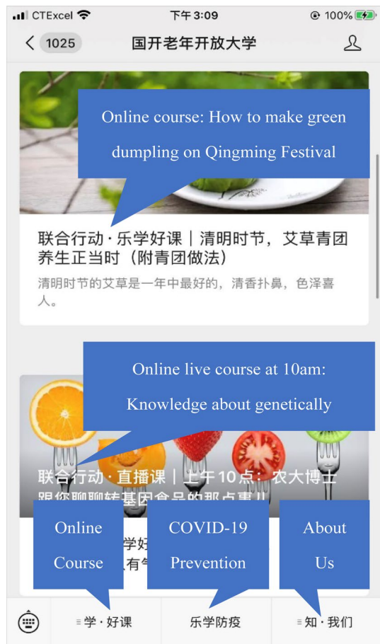
Fig. 2 WeChat official account of China Open University for the Aged (in Chinese)

categories of social media applications that older adults are generally familiar with, as well as possible ways to use social media in senior citizen education. Colleges should also offer courses that are more relevant to the needs of senior citizens. There are two major issues that should be considered when establishing courses or trainings. The first aspect is that the course should focus on ICT skills, including the basic use of a mobile phone and the use of common social media platforms for learning. Such content could reduce students' TA and improve their SE. Teacher training is another possible avenue for constructive intervention. According to the qualitative data, SN has a positive influence on PU and PEU. If teachers use social media for teaching or encourage the students to use it, then older adults will be more inclined to use it. The second aspect is that learning materials related to information literacy should be included. For example, teachers could introduce the advantages of mobile social media and information about identifying and preventing network fraud. As a