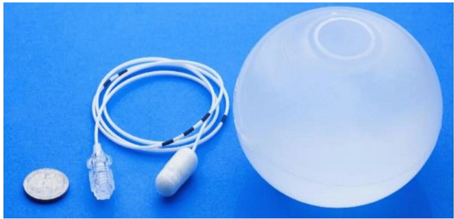
FIGURE 1: Allurion Elipse™ balloon with catheter for inflation