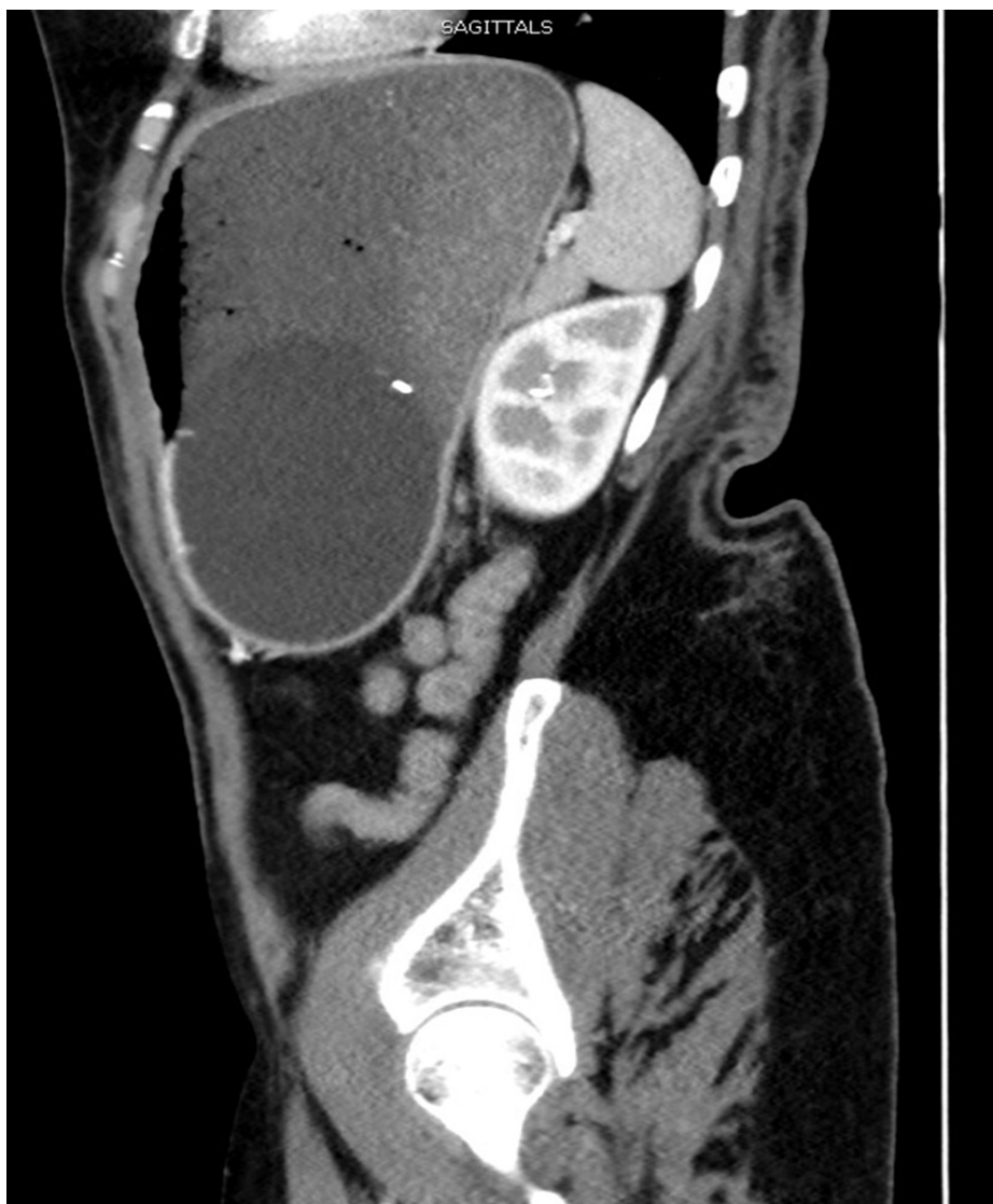
FIGURE 3: Sagittal view of the Elipse™ intragastric balloon obstructing the gastric outlet