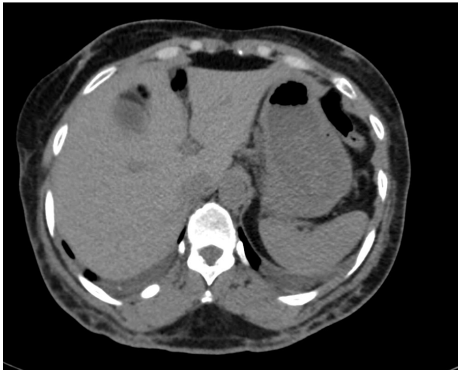
FIGURE 6: Computer tomography of abdomen showing resolution of the obstruction after endoscopic retrieval of the balloon