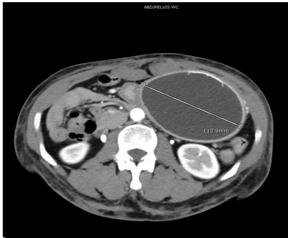
FIGURE 4: Computer tomography of abdomen showing balloon placed in the stomach and its diameter