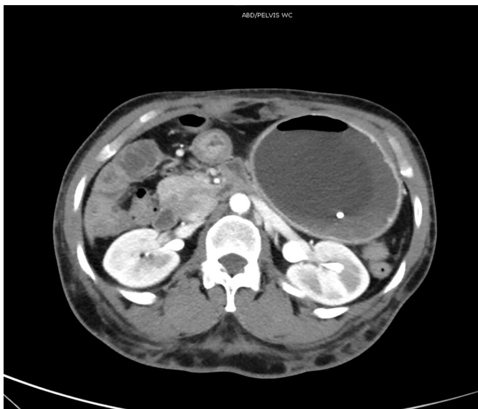
FIGURE 2: Computer tomography of abdomen showing the balloon marker