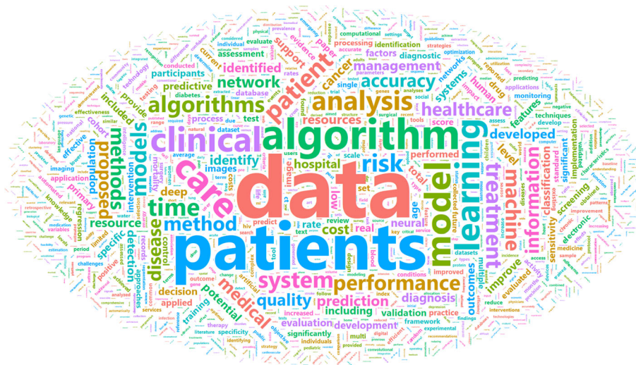
Figure 2 Visualizing the opportunity to focus on diversity and health equity. The figure shows the authors' own qualitative analysis of a PubMed search for articles published in 2019. The text analysis displays the frequency of words used in the title and abstracts of 2994 published articles in 2019 that use AI tools and methods related to health care delivery. Words related to diversity, disparities, equity, and related terms were found infrequently.

devices can provide valuable insights. Incorporating these data would require active patient and community partnerships to ensure equitable access to these devices and inclusion of data into clinical research and practice. For example, SDOH screening efforts at the clinic level in closed-looped data systems can augment geographic data on service location from AI-based tools. 24 Increasingly, large research cohort studies, such as the National Institutes of Health (NIH) All of Us Research Program provides tools for integrating novel, participant-collected data sources from diverse groups as a part of the NIH's Precision Medicine Initiative. 25