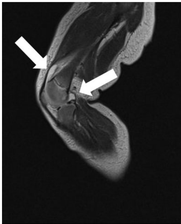
Fig. 1 MRI (1.5 T), surface coil. T2 Turbo Spin Echo coronal 3 mm. Left knee: small amount of joint effusion in the suprapatellar and posterior recess (arrows). No bone affection was noted. MRI, magnetic resonance imaging.

Laboratory results showed a slightly elevated C-reactive protein (CRP) of 21 mg/L and a normal white blood cell count without a left shift in the white blood cell differentiation. A blood culture was obtained. Sonography of the hip and knee was normal with no detectable joint effusions. After admission, antibiotic treatment with ampicillin (150 mg/kg/day) and gentamicin (4 mg/kg/day) was initiated due to the slightly elevated CRP and suspected osteomyelitis or arthritis. The magnetic resonance imaging (MRI) on the next day showed a small effusion within the left knee joint, suggestive of a local inflammatory process not affecting the extra-articular bone tissue and most likely considered as septic arthritis (→ Fig. 1). The ultrasound scan one day later eventually confirmed a small effusion. After GBS isolation in the blood culture (positive after 6.2 hours) antibiotic treatment was switched to intravenous penicillin G (300,000 units/kg/day divided in doses every 8 hours) and continued for