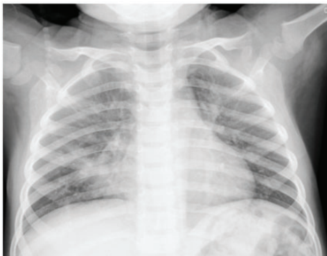
Figure 2. A chest radiogram shows patchy opacification in both lungs, especially in the right lower zone, 15 minutes after the fibrotic bronchoscopic procedure.

Type II NPPE develops after relief of upper airway obstruction. Chronic upper airway obstruction is believed to result in an increased effort for breathing, which can