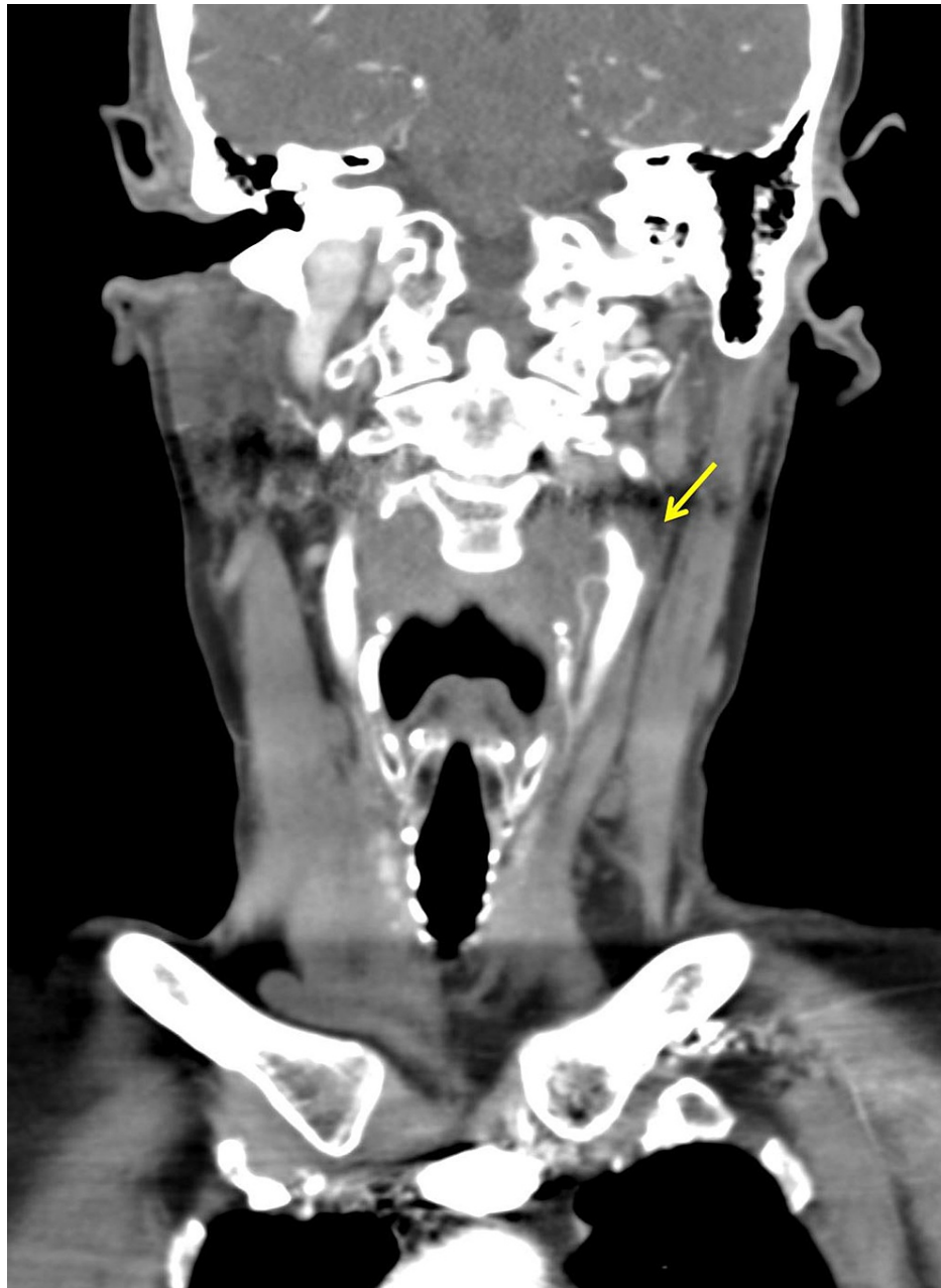
FIGURE 1: Coronal contrast-enhanced CT image demonstrating inflammatory soft tissue (arrow) surrounding the left distal common carotid trunk and carotid bifurcation without notable luminal narrowing.

In light of the location and unremitting nature of the pain, CT angiography was obtained and revealed the presence of an enhancing inflammatory tissue encircling the left common carotid artery and bifurcation. No evidence of luminal narrowing was noted (Figures 1, 2). The patient ultimately sought consultation elsewhere and was lost to follow-up.