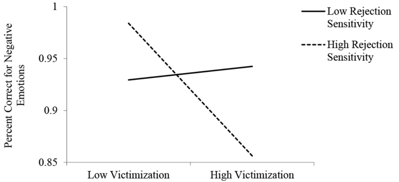
Figure 3. The interactive contributions of victimization and rejection sensitivity predicting labeling accuracy for negative emotions.