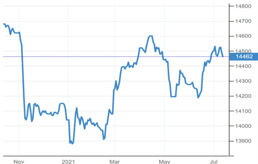
Fig. 3 Indonesian rupiah (IDR) against the US dollar (USD) to July 14th, 2021.