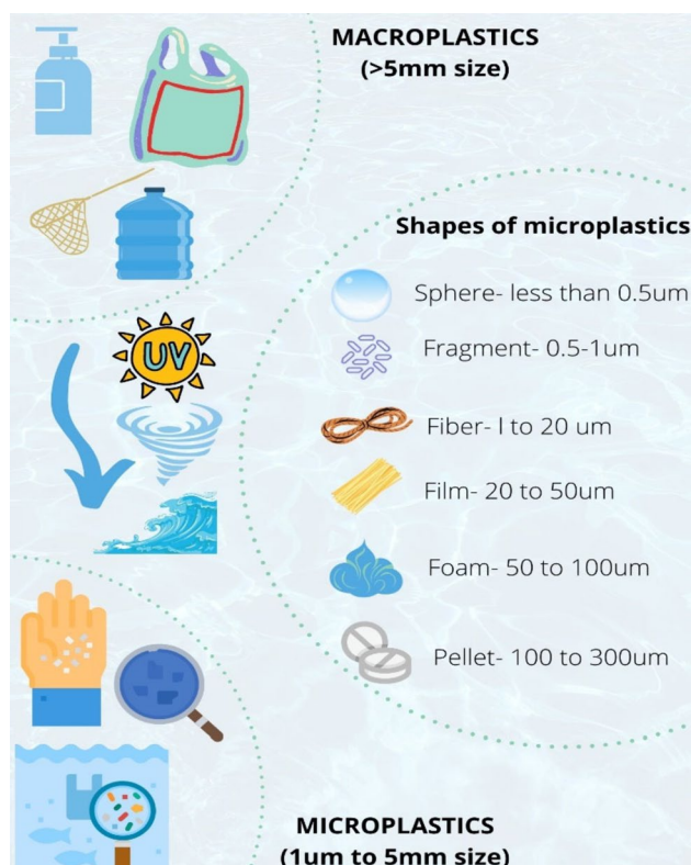
Fig. 2 Sizes and shapes of microplastics. Sizes: macro and microplastics. Shapes: spheres, fragments, fibers, films, foams, pellets

which are used to improve their structural properties, also contribute to toxic effects in living organisms during their leaching by weathering (Beiras et al. 2021; Hummel et al. 2021). Implication of additives of biological origin, instead of commercially applied additives may decrease the aquatic toxicity.