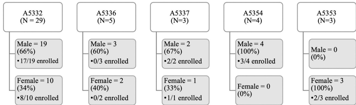
Figure 2. Potential participants screened and enrolled (Emory).