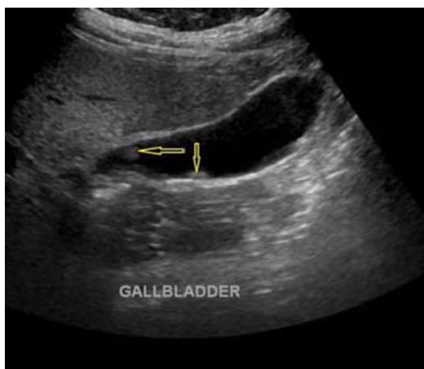
Figure 4. Ultrasound image showing multiple gallbladder polyps (yellow arrows)

in risk when compared with the Sub-Saharan Africans, which had the lowest prevalence rate of GB polyps (3.7%). Southern Asians were significantly associated with the highest increase in risk of 5.8 times when compared with Sub-Saharan Africans. Among the remaining explanatory variables, only hypertension was associated with a significant increase in the risk of having GB polyps by 48%. In addition, testing positive for HBS antigens was associated with an obvious (but insignificant) increase in risk of GB by 2.4 times. All other independent variables tested were not significantly or were significantly associated with an