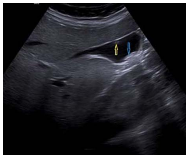
Figure 5. Ultrasound image showing gallbladder polyp (yellow arrow) and stones (blue arrow)

in risk when compared with the Sub-Saharan Africans, which had the lowest prevalence rate of GB polyps (3.7%). Southern Asians were significantly associated with the highest increase in risk of 5.8 times when compared with Sub-Saharan Africans. Among the remaining explanatory variables, only hypertension was associated with a significant increase in the risk of having GB polyps by 48%. In addition, testing positive for HBS antigens was associated with an obvious (but insignificant) increase in risk of GB by 2.4 times. All other independent variables tested were not significantly or were significantly associated with an