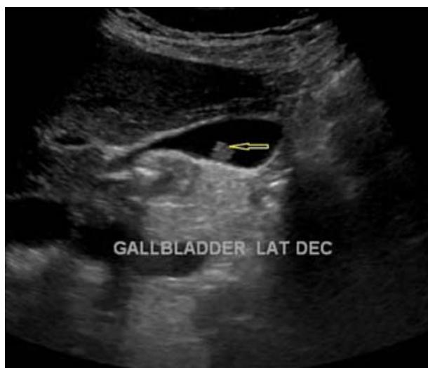
Figure 3. Ultrasound image showing a gallbladder polyp (yellow arrow)