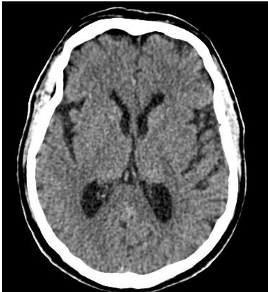
FIGURE 1: Computerized tomography (CT) of the head showing moderate parenchymal atrophy and microangiopathy. There was no sign of any acute pathology.