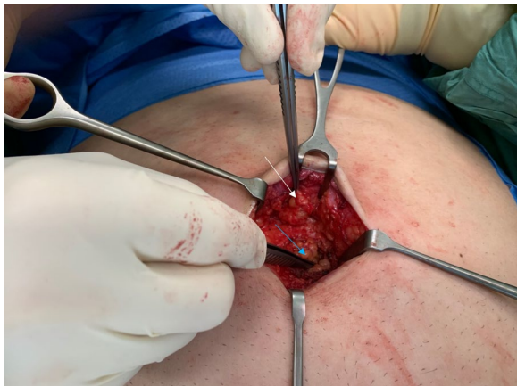
Fig. 1 Picture showing fenestrated linea alba with a hernia protruding through second defect (white arrow) cranial to the primary defect (blue arrow)

century earlier who identified lacunar defects in the linea alba [5, 6]. These two reports are limited in their scope and the latter is of historic interest.