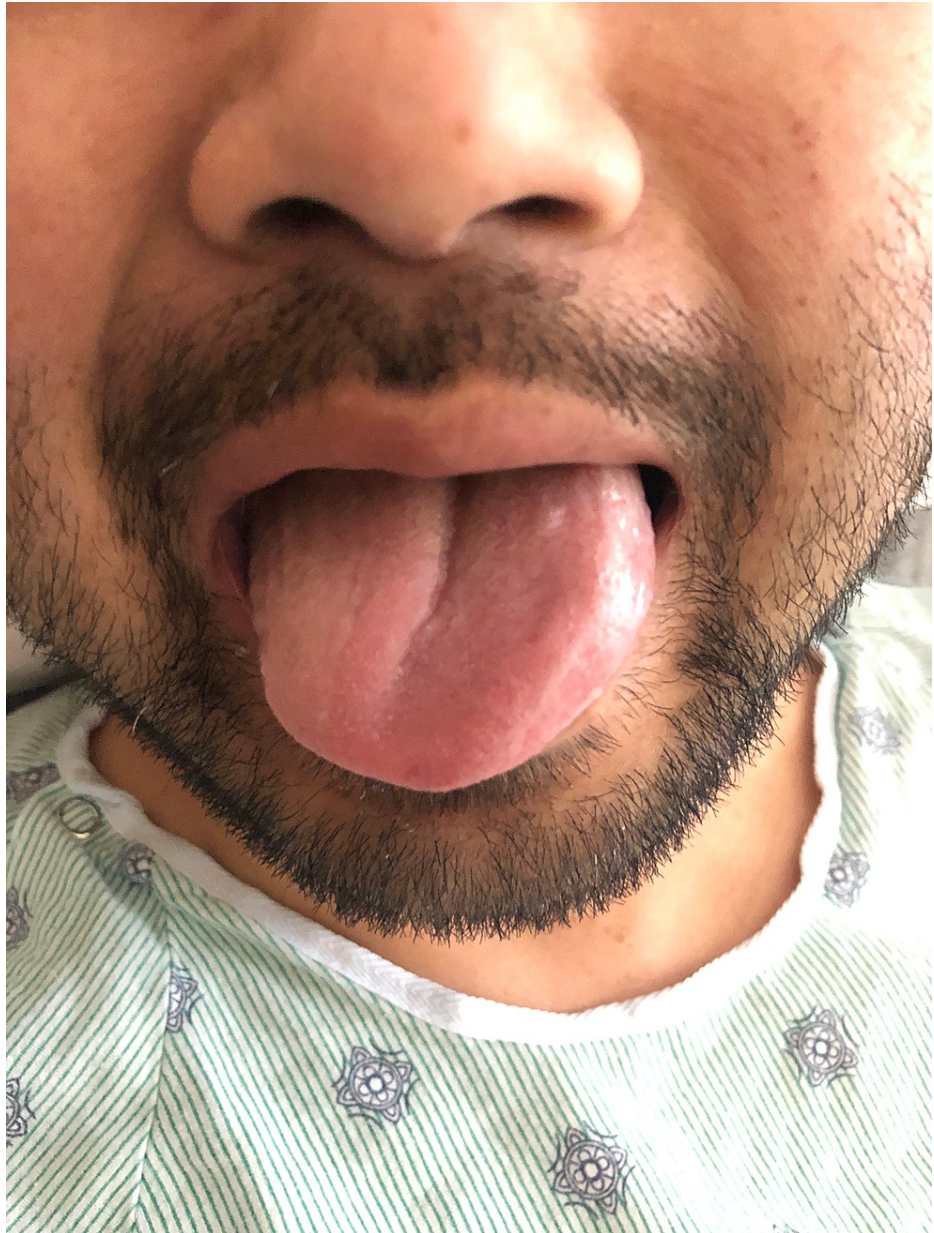
FIGURE 2: Rightward tongue deviation on attempted midline protrusion, indicative of right hypoglossal nerve injury.

Right side hypoglossal nerve and recurrent laryngeal nerve palsy were diagnosed, consistent with Tapia's syndrome. The patient was discharged on postoperative day two with acetaminophen for pain control and a dexamethasone taper. During the following weeks, the hypoglossal nerve palsy resolved; however, he continued to experience dysphonia. No symptoms of aspiration were reported. Fiberoptic endoscopy was performed in the otolaryngology clinic and showed immobility of the right vocal cord (Video 1). He later underwent a right vocal fold injection with Prolarynx gel (Merz North America, Inc, Greensboro, NC, USA) via flexible laryngoscopy with a slight improvement in his dysphonia. At the time of writing, the patient continues to follow up with the laryngology clinic, and has not yet had normal return of recurrent laryngeal nerve function. At the last visit, he declined further interventions based on acceptable voice quality.